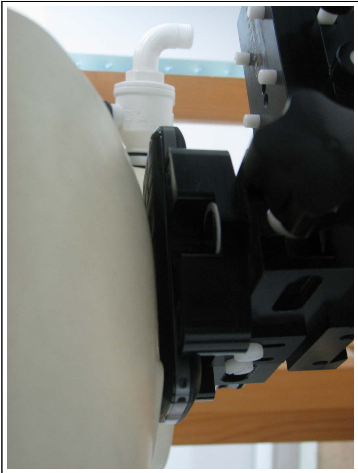
Figure 1 Right Head SAR Test Setup - Cheek Touch Position