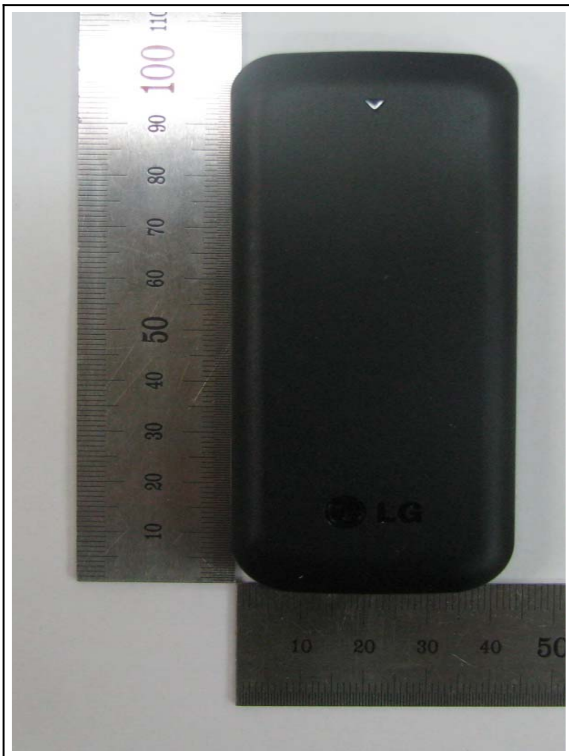
Figure 8 DUT Photo