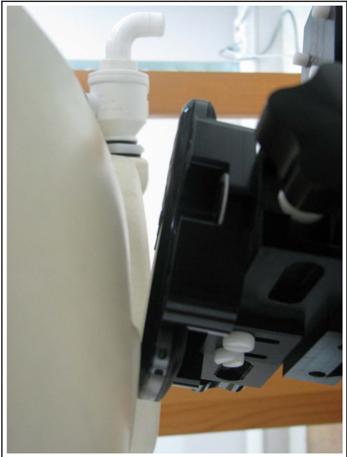
Figure 2 Right Head SAR Test Setup - Ear Tilt Position