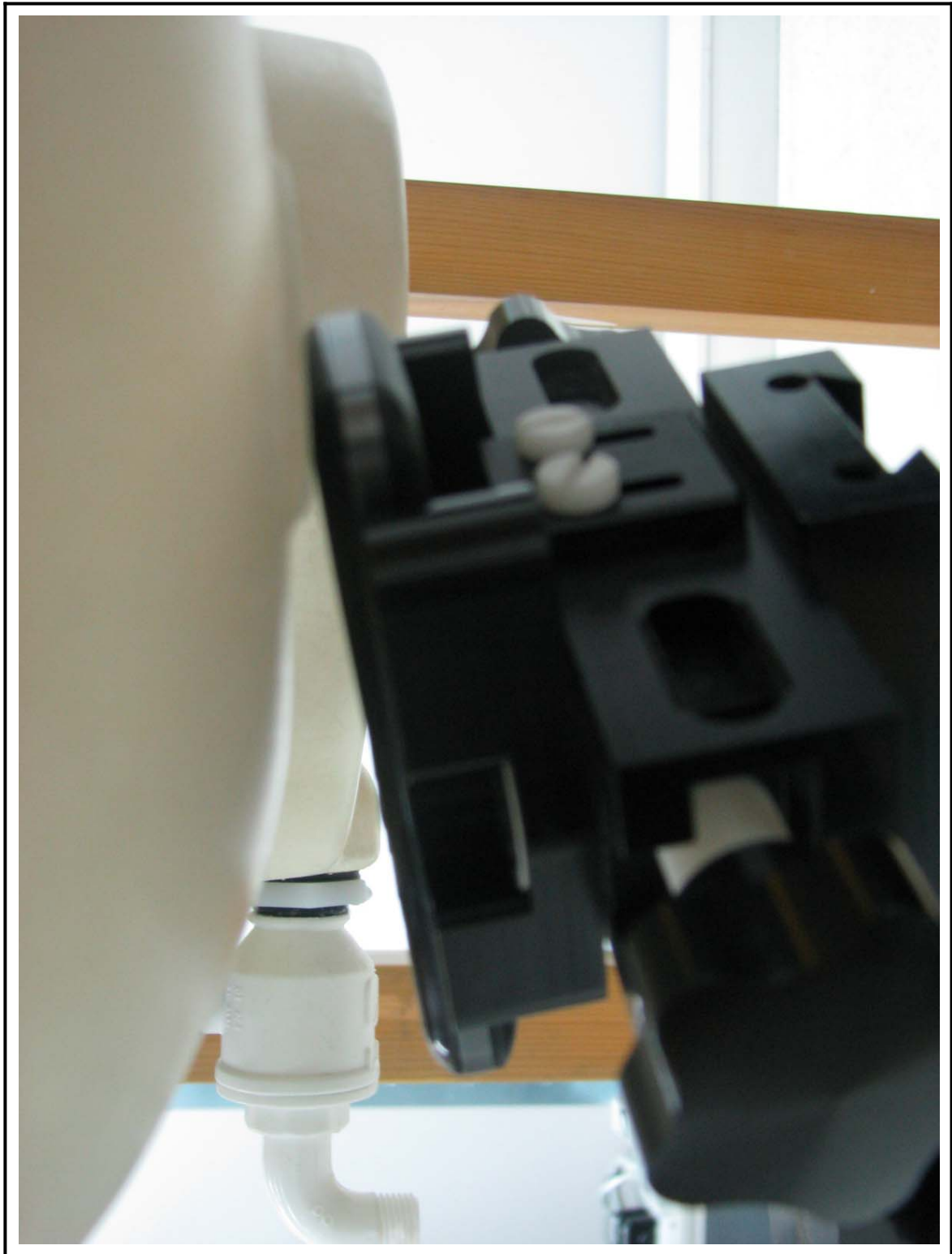
Figure 4 Left Head SAR Test Setup - Ear Tilt Position