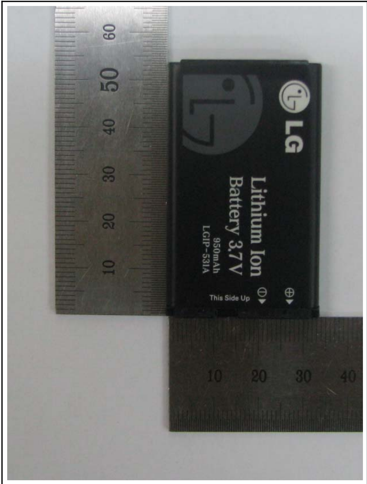
Figure 10 DUT Photo