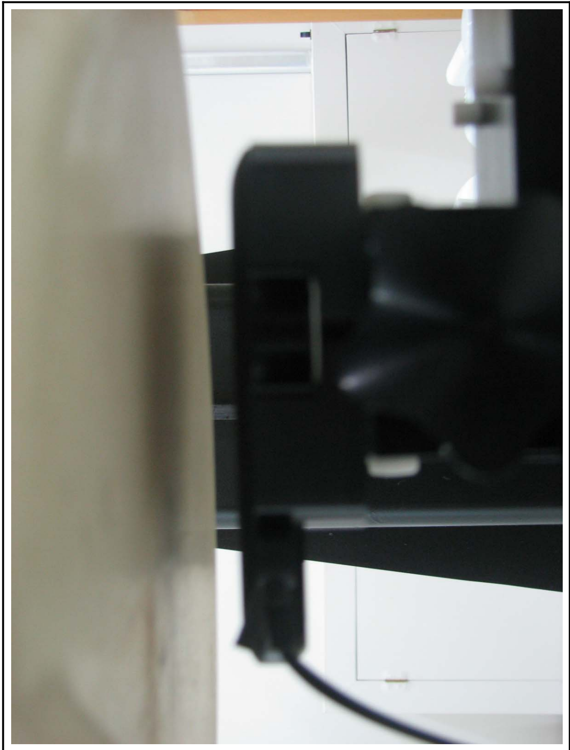
Figure 6 Body SAR Test Setup – w/o Holster