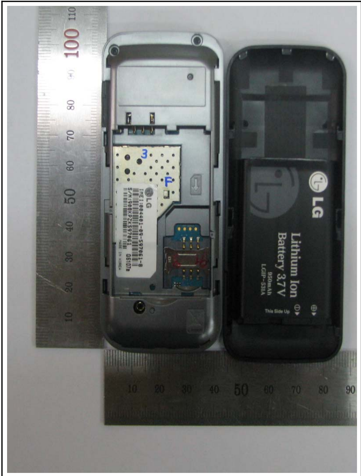
Figure 9 DUT Photo