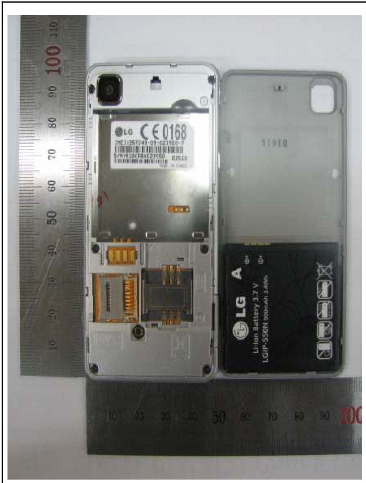
Figure 9