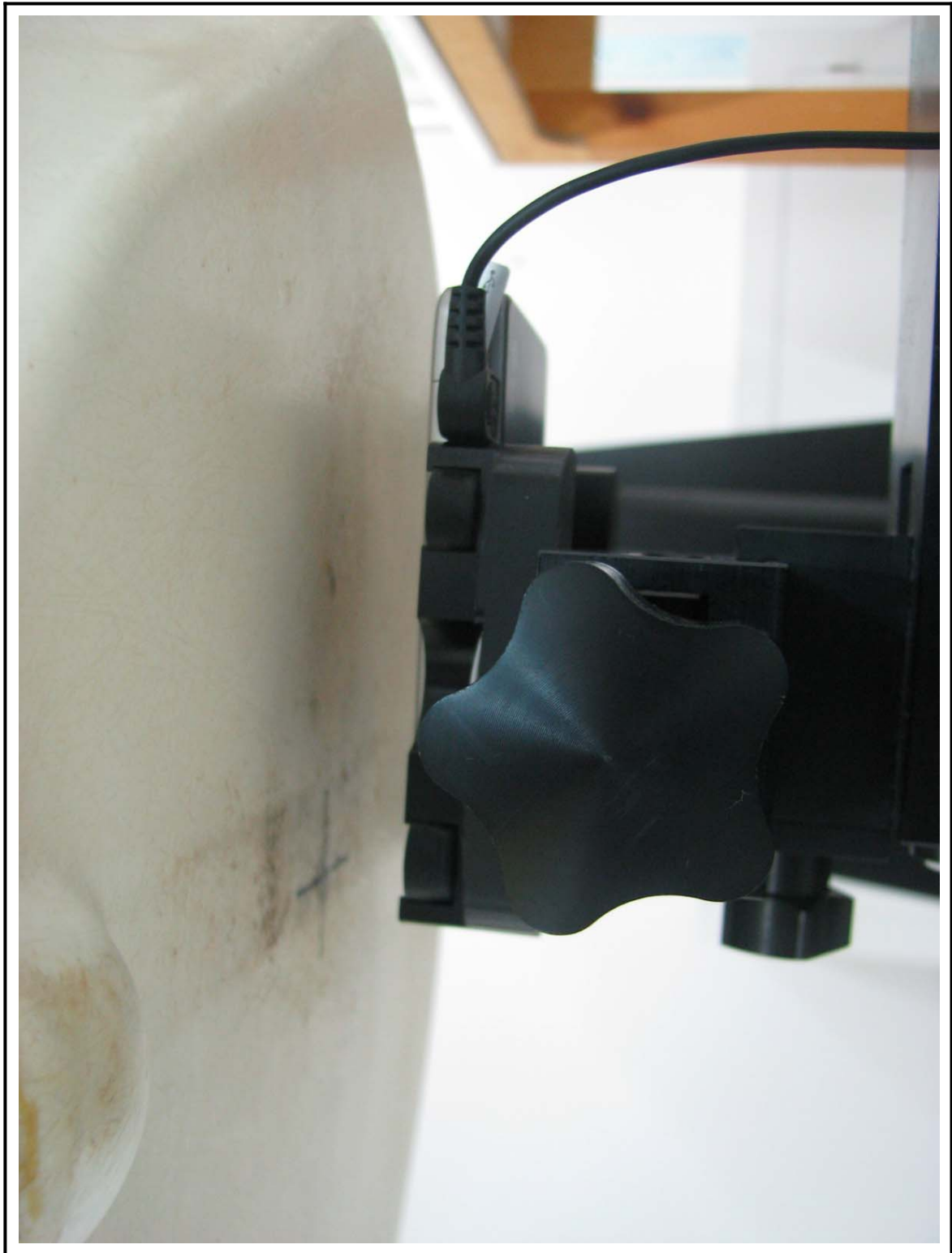
Figure 5 Body SAR Test Setup – w/o Holster