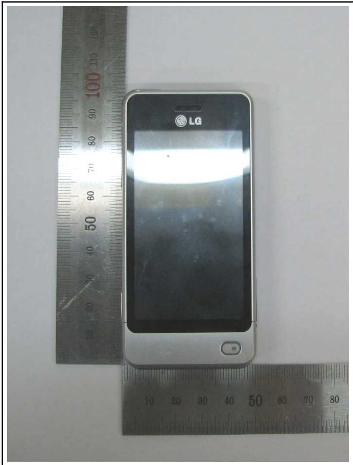
Figure 7 DUT Photo