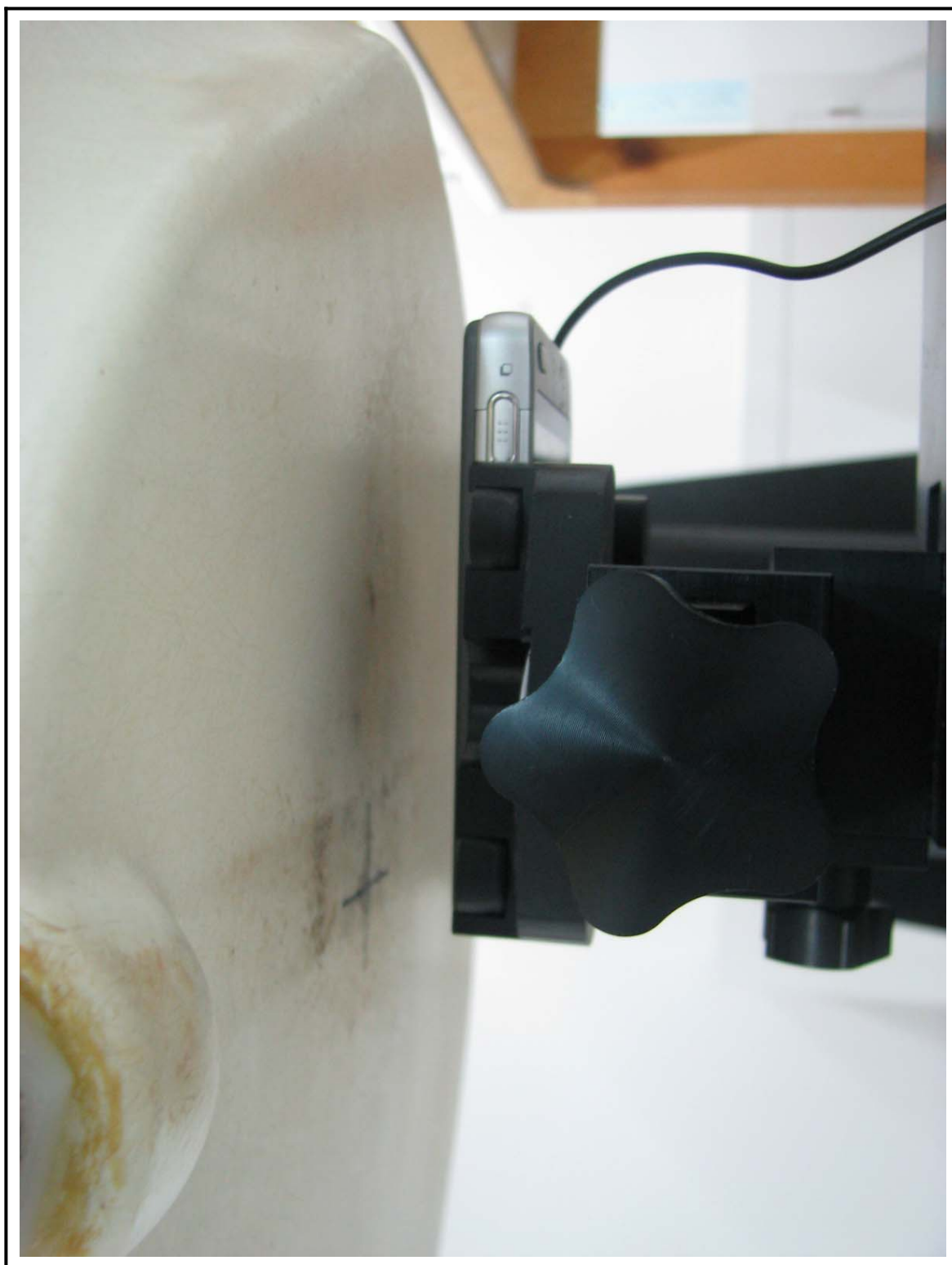
Figure 6 Body SAR Test Setup – w/o Holster