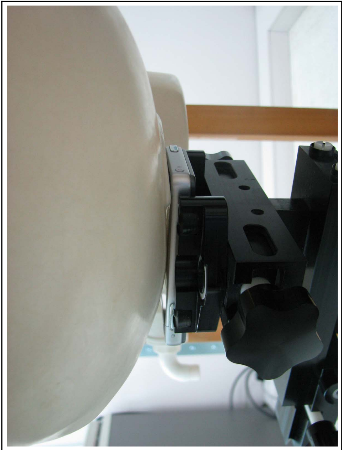
Figure 3 Left Head SAR Test Setup – Cheek Touch Position