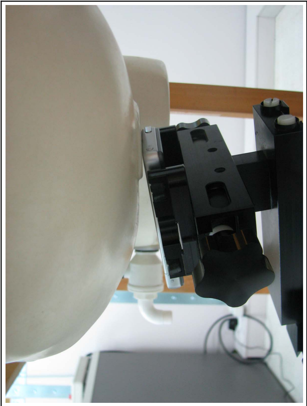
Figure 4 Left Head SAR Test Setup - Ear Tilt Position