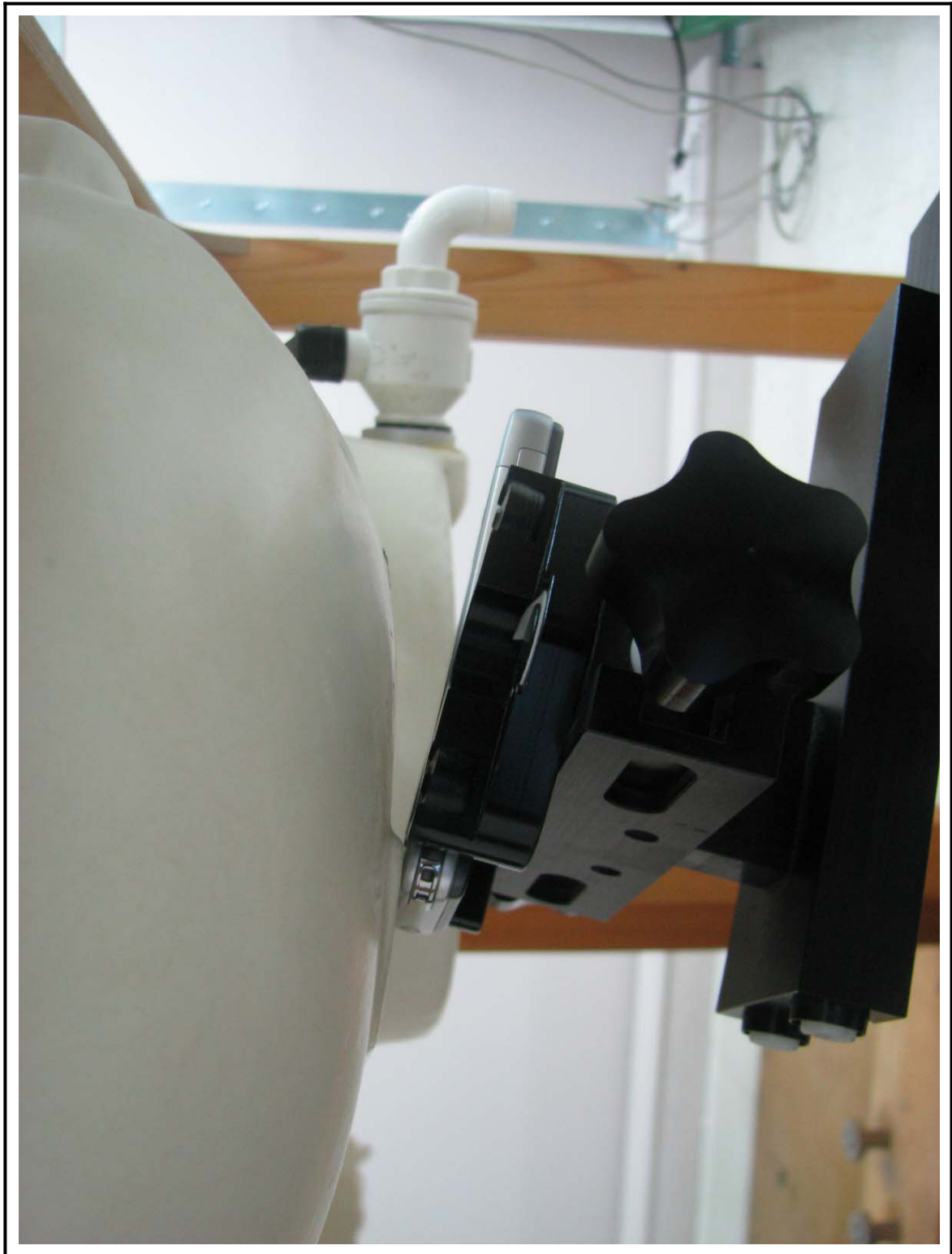
Figure 2 Right Head SAR Test Setup - Ear Tilt Position