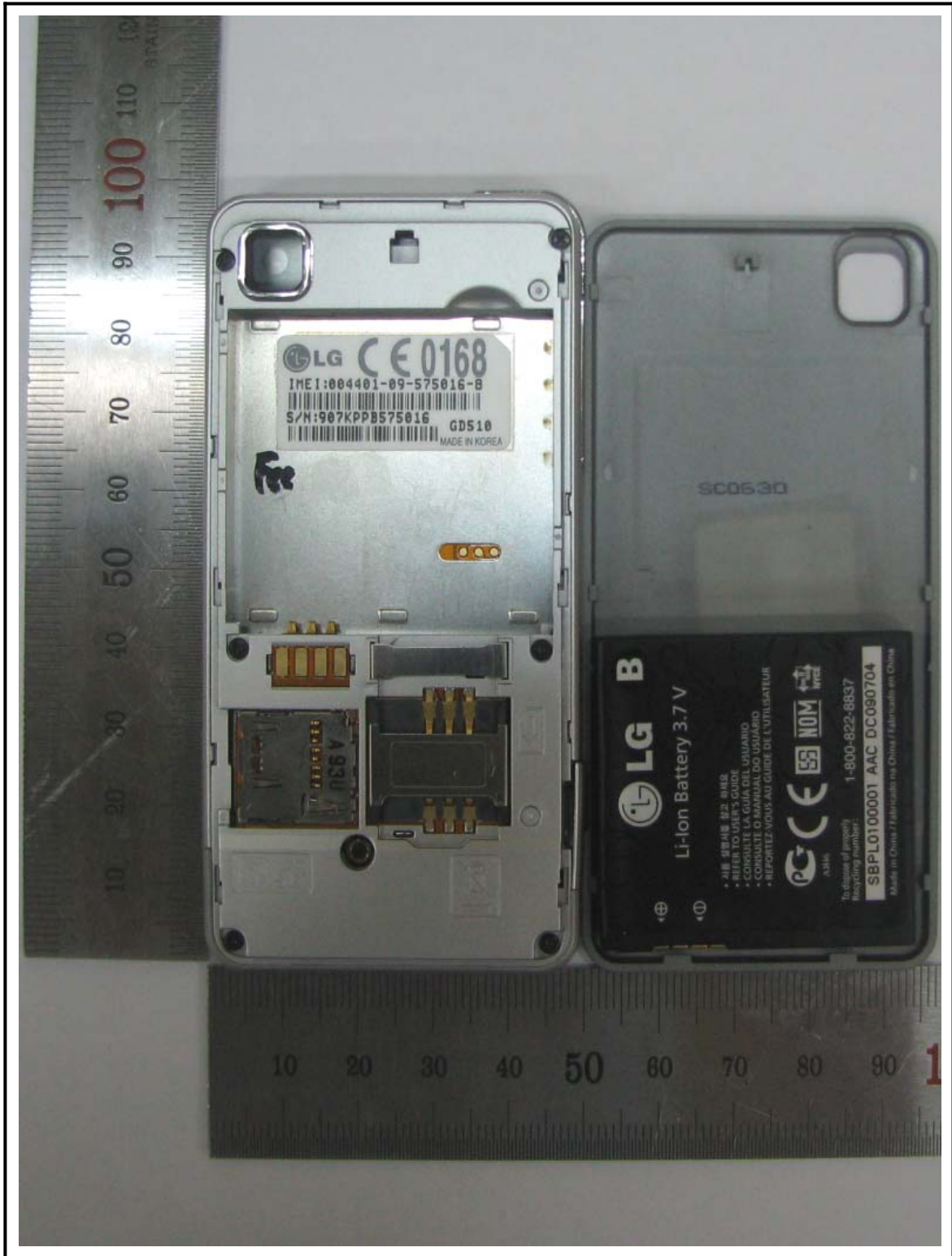
Figure 9 DUT Photo