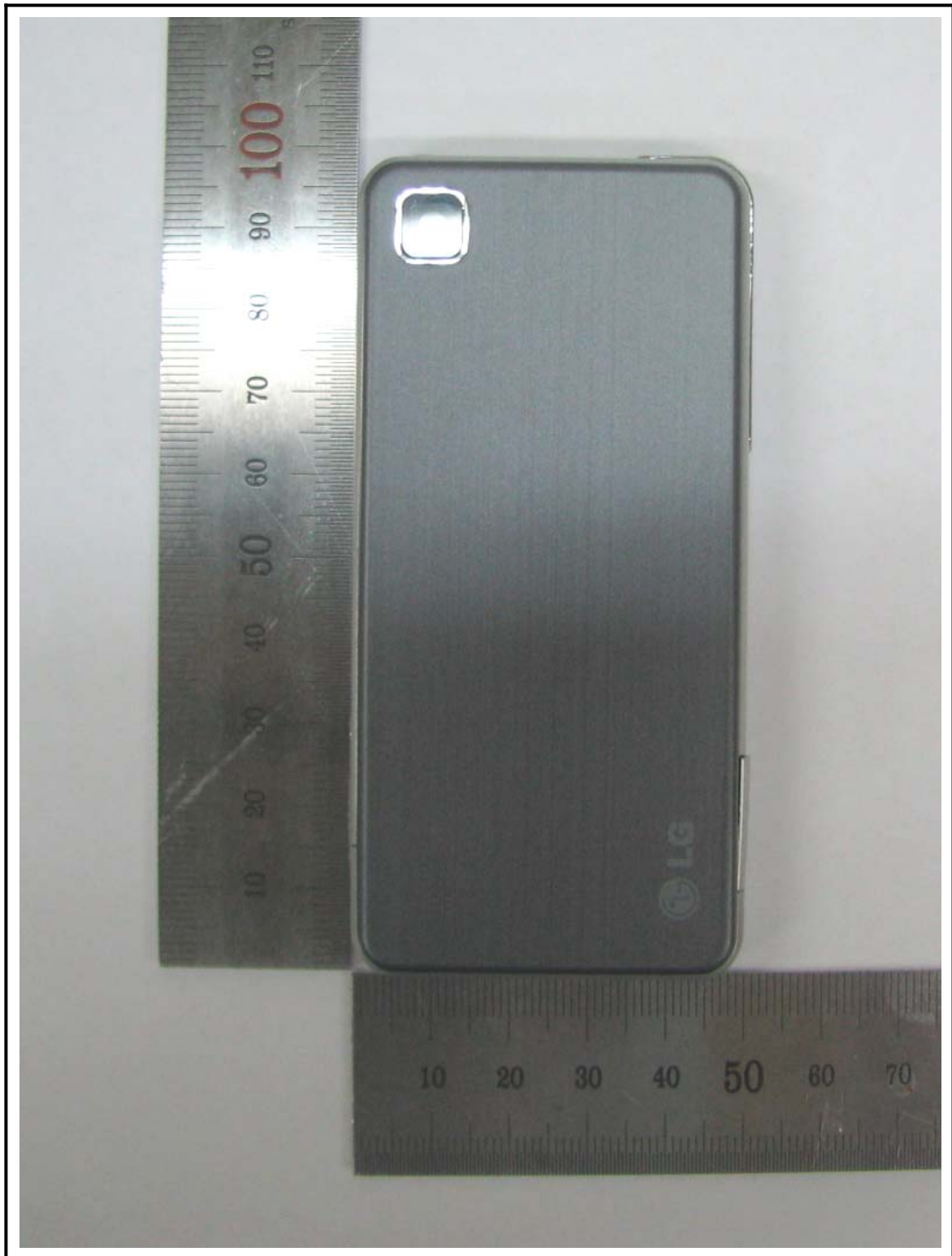
Figure 8 DUT Photo