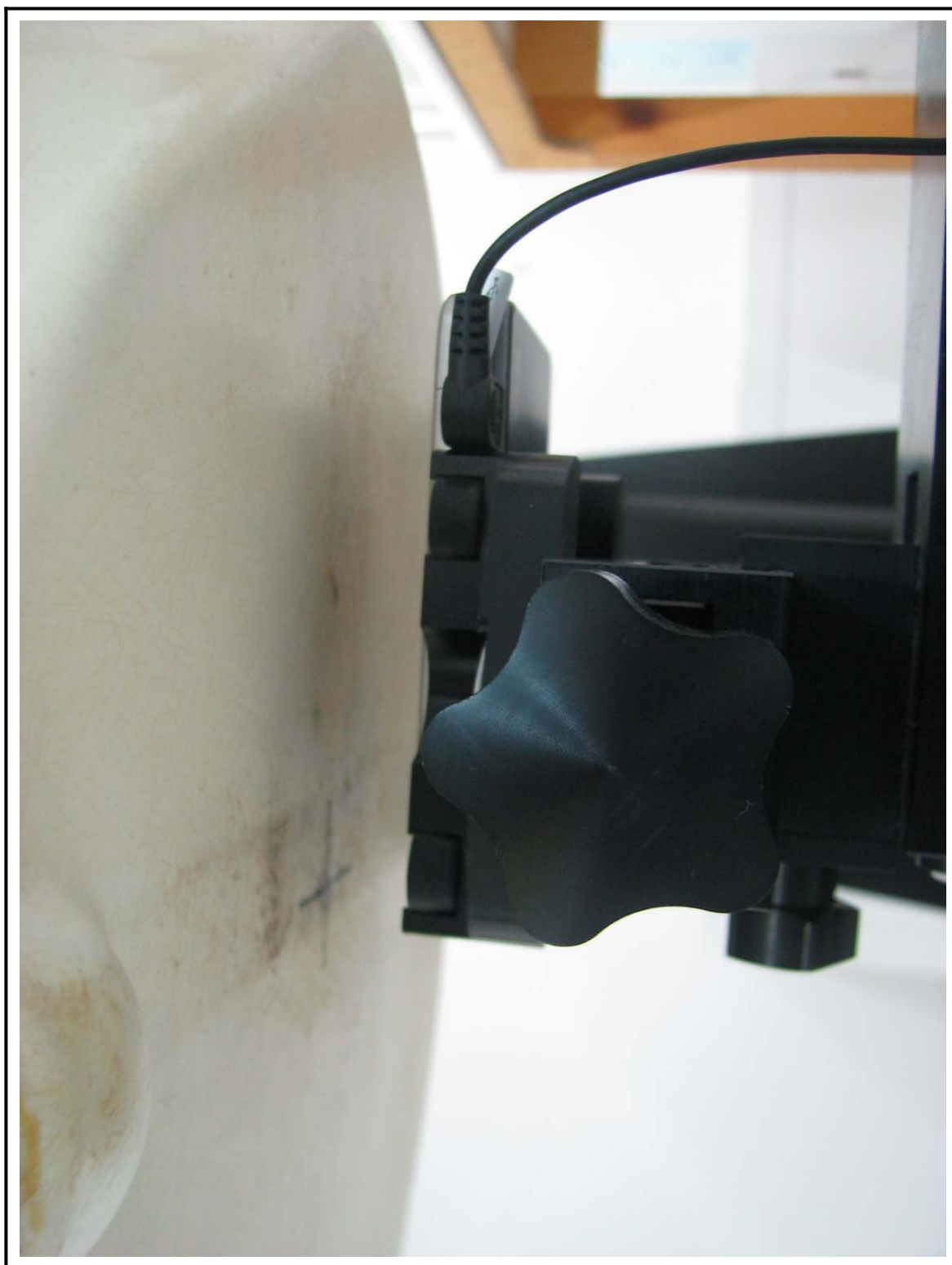
Figure 5 Body SAR Test Setup – w/o Holster