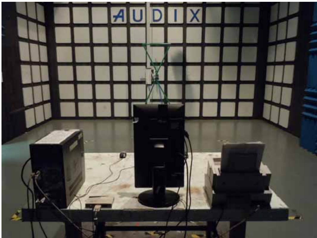
BACK VIEW OF RADIATED EMISSION TEST (BELOW 1GHZ) (ROTATION)