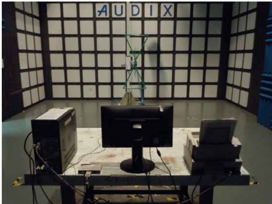
BACK VIEW OF RADIATED EMISSION TEST (BELOW 1GHZ)