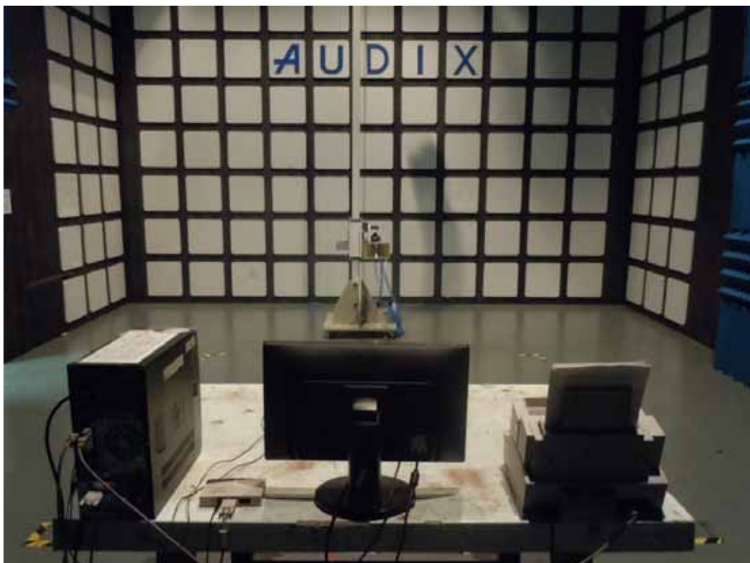
BACK VIEW OF RADIATED EMISSION TEST (ABOVE 1GHZ)