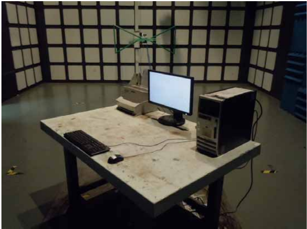
SETUP WITH MAXIMUM DETECTED EMISSION AT HORIZONTAL POLARIZATION (TEST MODE: DVI 1920*1080@60Hz)