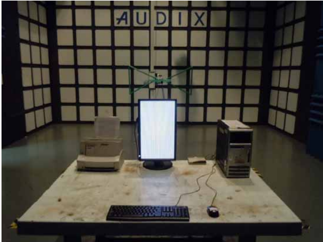
FRONT VIEW OF RADIATED EMISSION TEST (BELOW 1GHZ) (ROTATION)