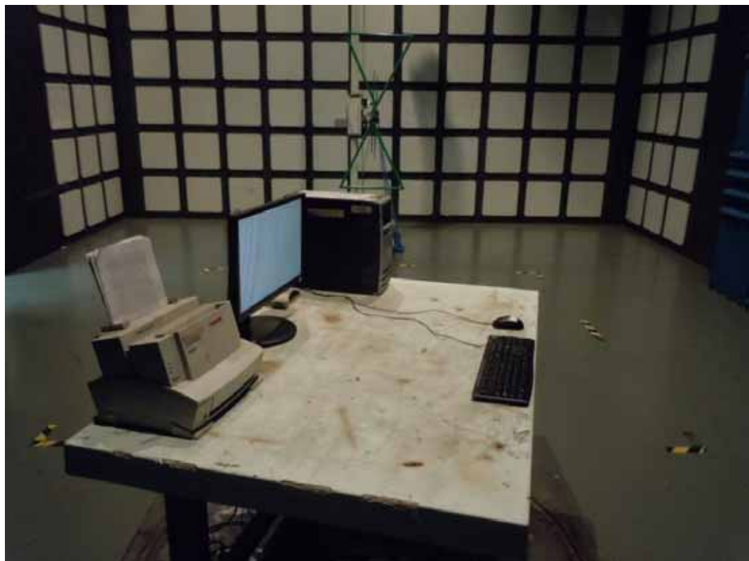
SETUP WITH MAXIMUM DETECTED EMISSION AT VERTICAL POLARIZATION (TEST MODE: DVI 1920*1080@60Hz)