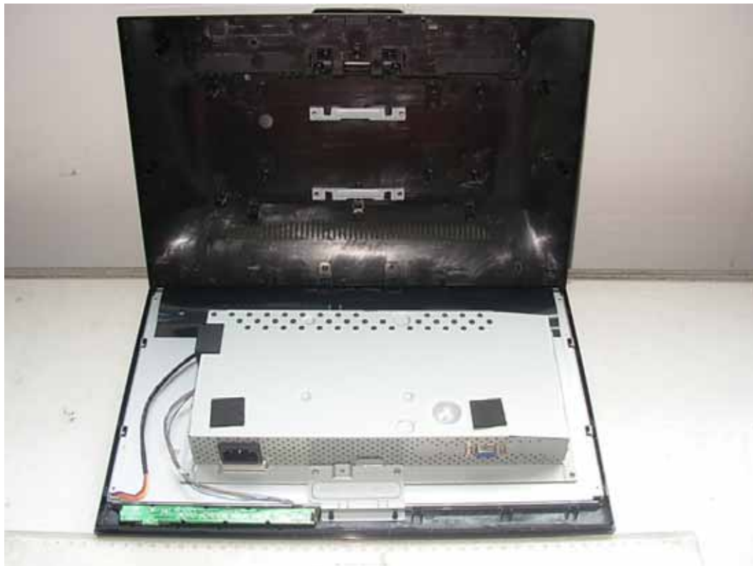
FIGURE 2 LCD MONITOR (M/N: E1641SX) LABEL ON PANEL