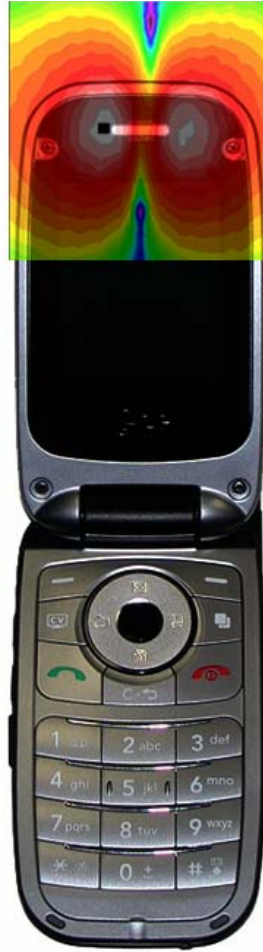
Radial H (Transverse)