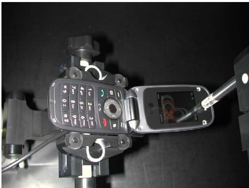
Figure 13-1 Test Setup for Wireless Device