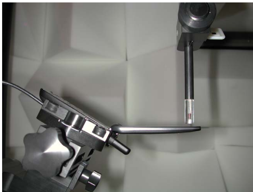
Figure 13-2 Test Setup for Wireless Device