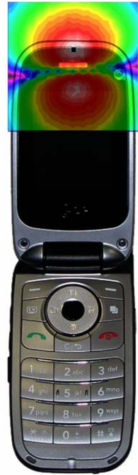
Radial V (Longitudinal)

Note: final measurement locations are indicated by a cursor on the contour plots.