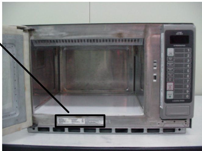
< Fig. 2. Photo of the physical location of the label>

* Alternate location: The nameplate may be alternatively affixed on the rear surface of oven cavity, left side of control panel or internal surface of oven cavity