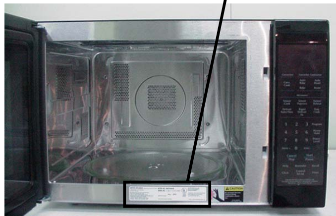
< Fig. 2. Photo of the physical location of the label>

* Alternate location: The nameplate may be alternatively affixed on the left side of control panel or internal surface of oven cavity or rear surface of oven.