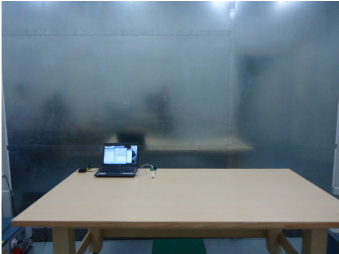
FRONT VIEW OF CONDUCTED MEASUREMENT