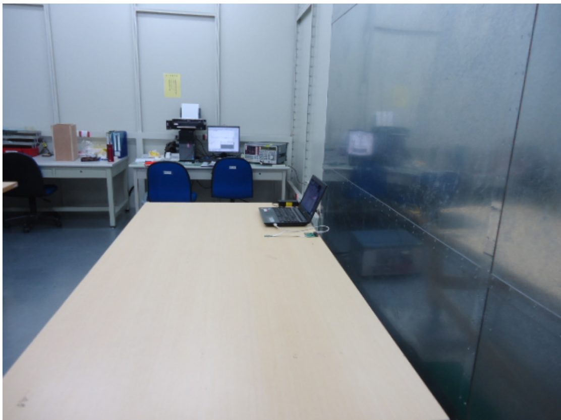
BACK VIEW OF CONDUCTED MEASUREMENT