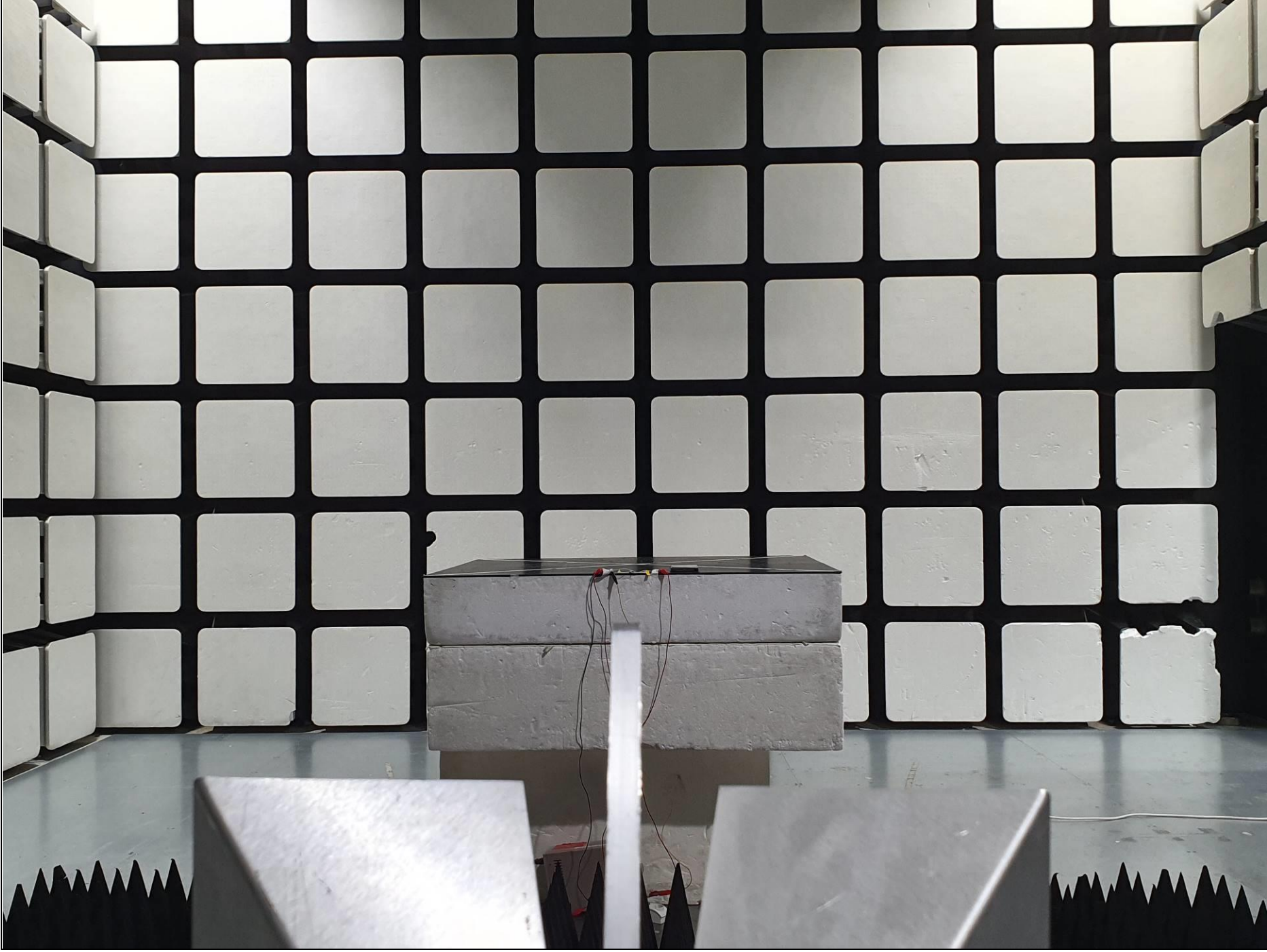
RE(Above 1 GHz)_Rear