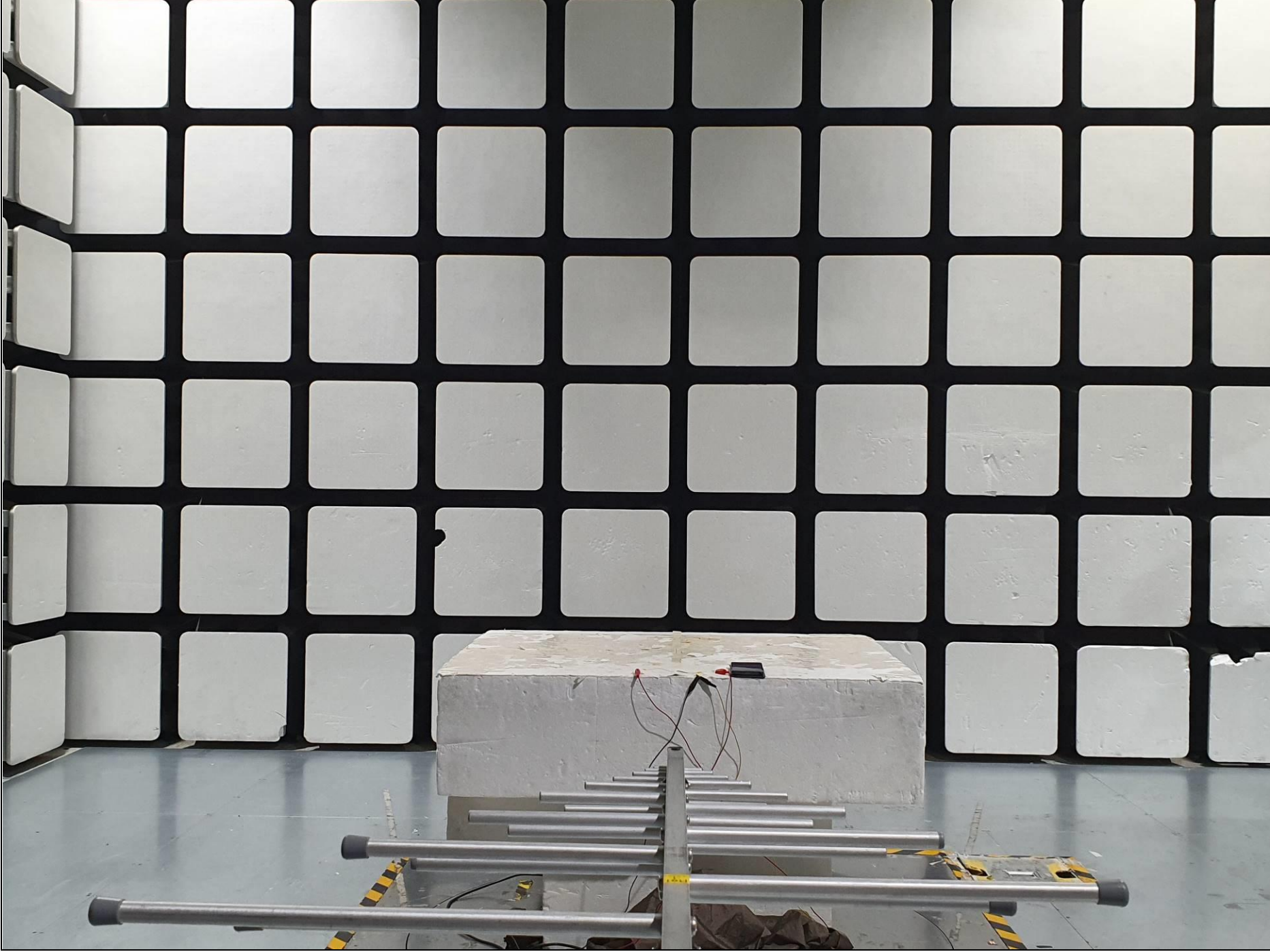
RE(Below 1 GHz)_Rear