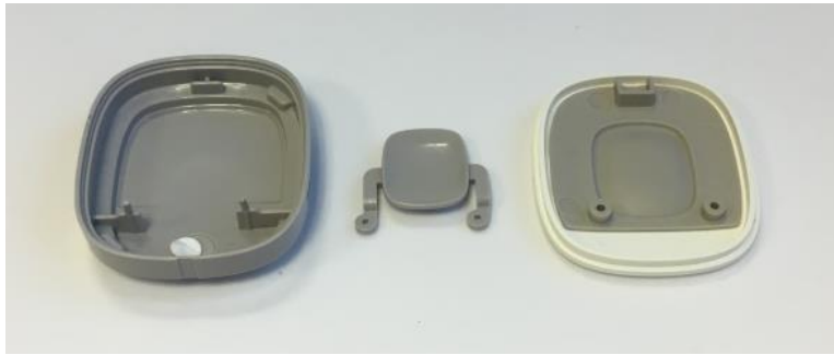
Figure 1: Enclosure bottom part (left), top part (right) and button part