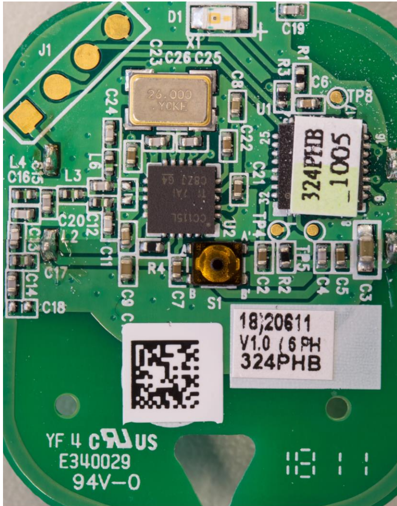
Figure 3: Detailed picture of PCBA