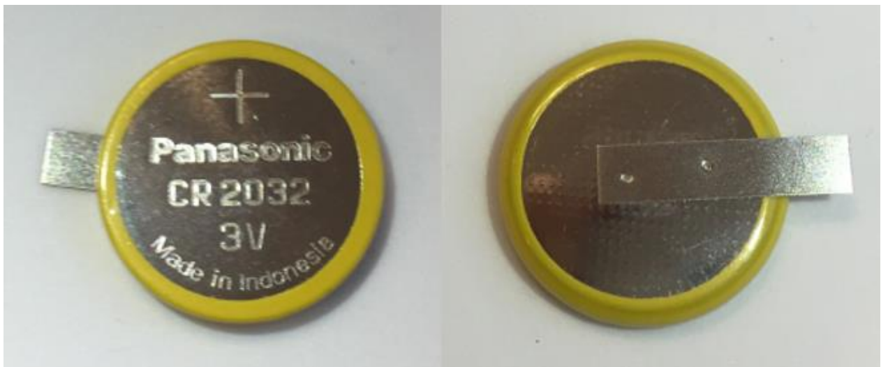
Figure 4: Battery top and bottom side