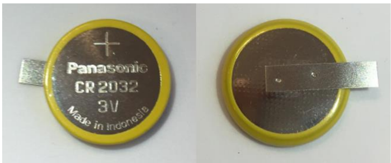
Figure 4: Battery top and bottom side