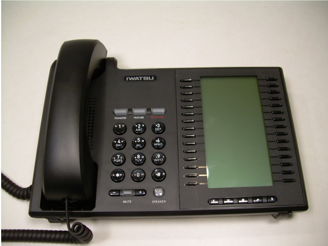
Top View of the IX-5930