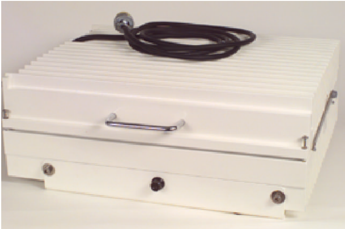
Figure 1 - External View 1