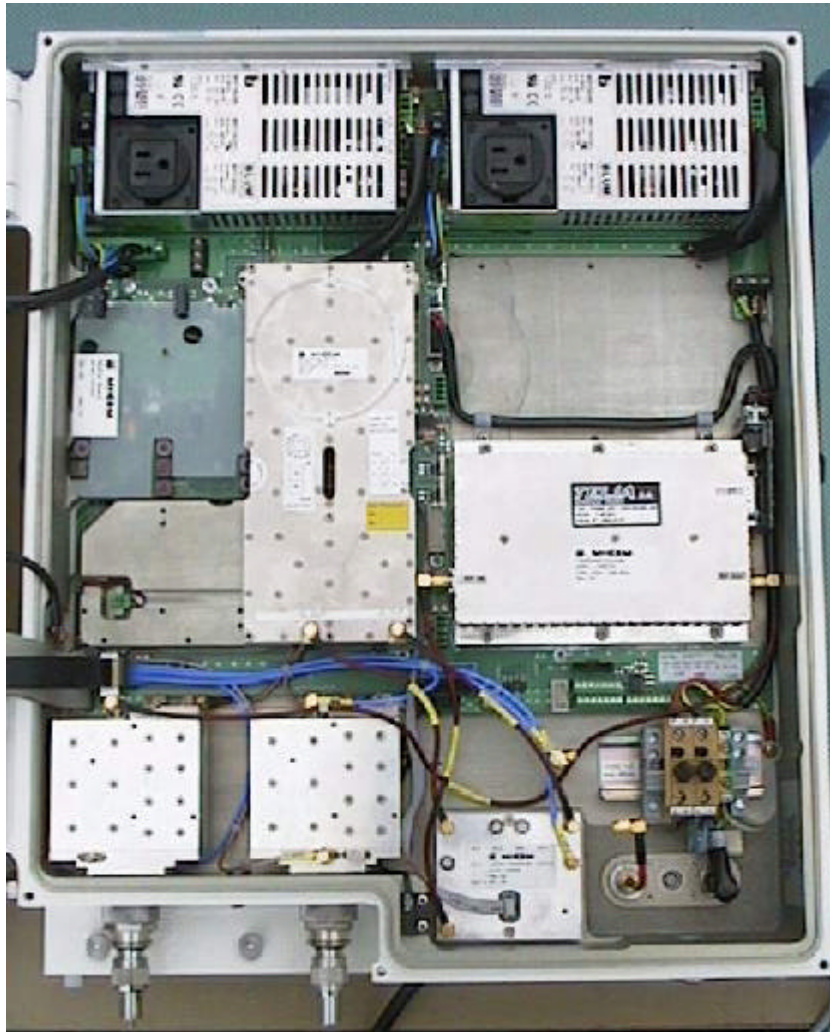
Figure 3 - Right Side of EUT Cabinet