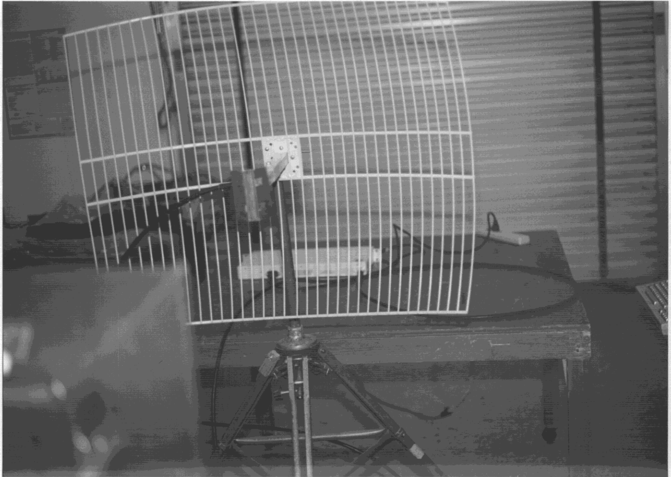
Figure 3. Another view. Photograph of Aurora 2400 Transmitting antenna and EMCE Receiving antenna setup for Radiated Emissions measurement. Test distance equals 1 meter. Aurora Radio on wooden table.