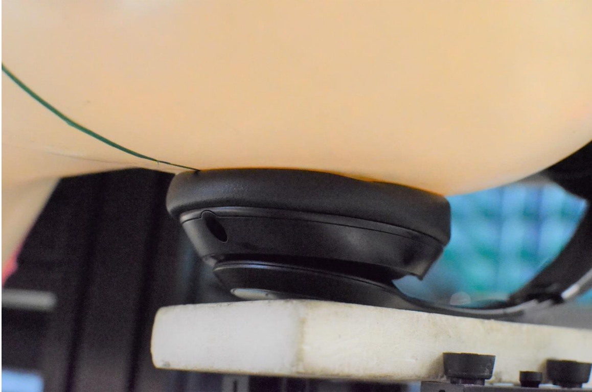
SAR Test Setup Photo 1: Left Head SAR Cushion Side at 0.0 cm