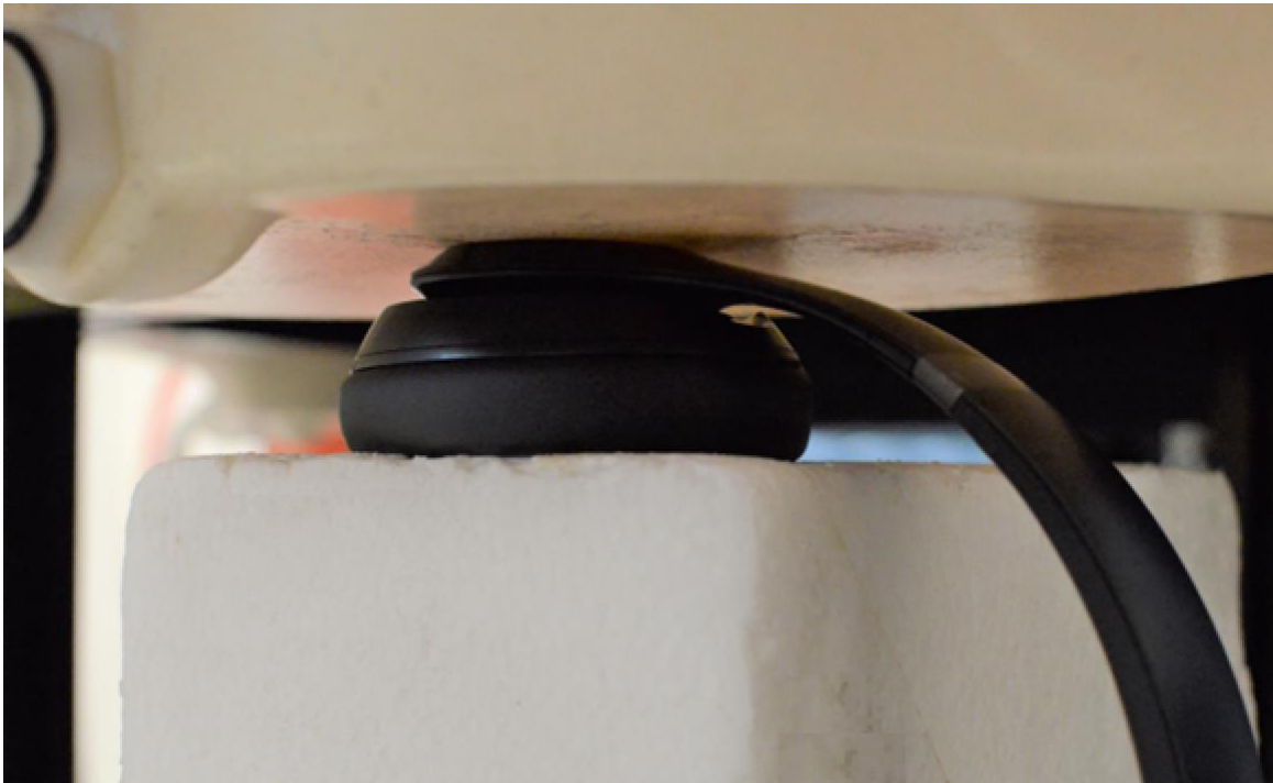
SAR Test Setup Photo 4: Logo Extremity SAR at 0.0 cm