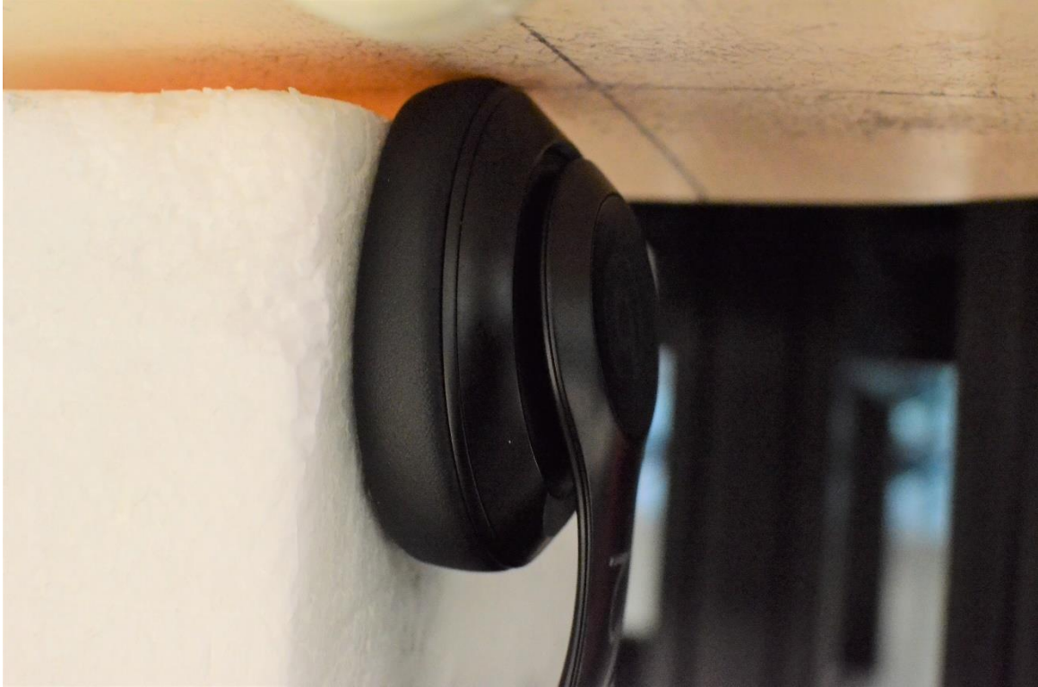
SAR Test Setup Photo 3: Bottom Edge Extremity SAR at 0.0 cm