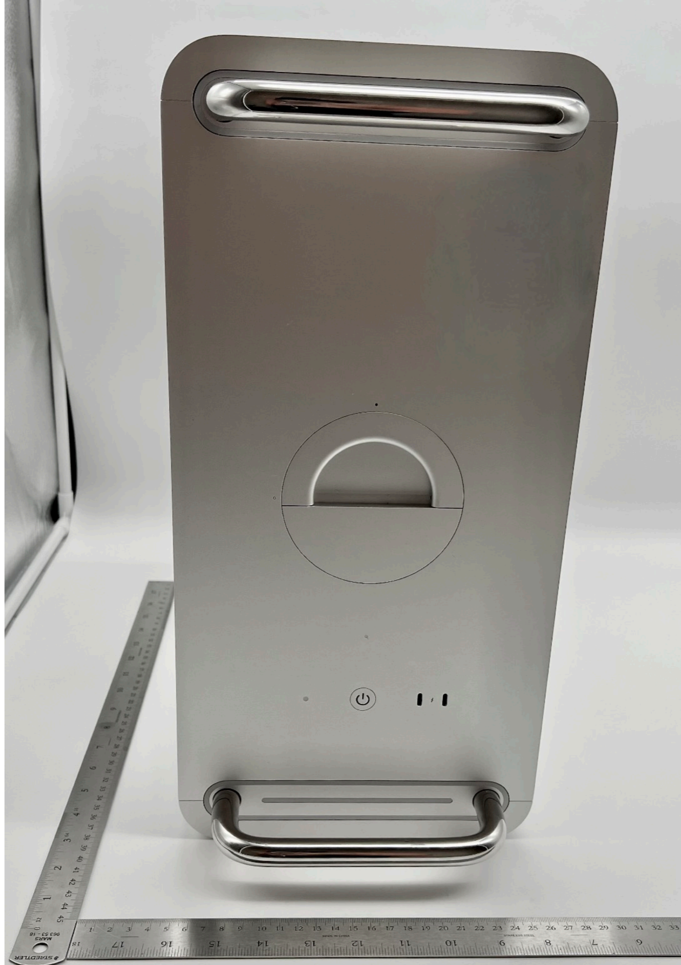
A2786 - Top