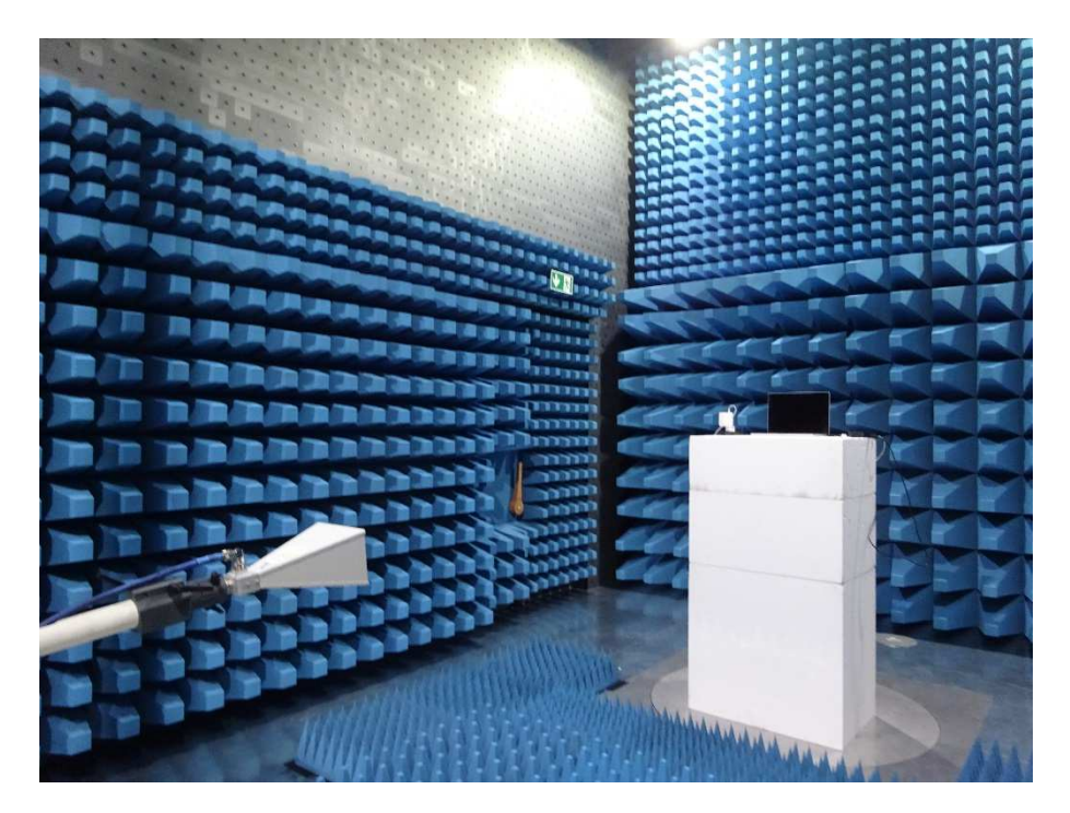
Figure 4 - Radiated Disturbance - Above 1 GHz