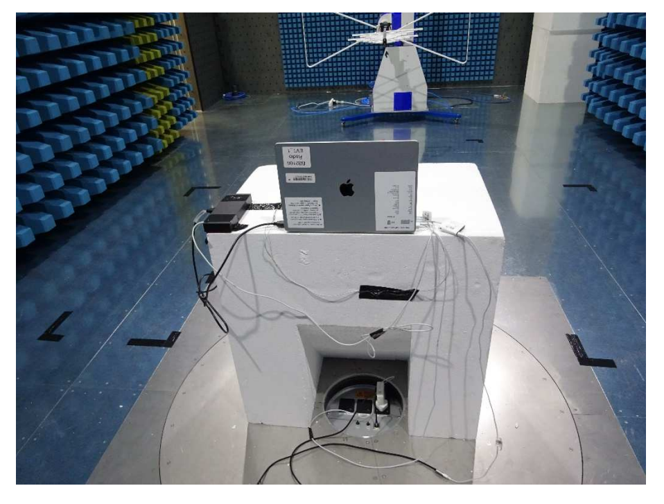
Figure 1 - Radiated Disturbance - Below 1 GHz