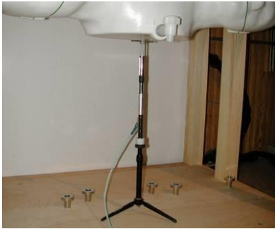
Figure 8-2 System Verification Setup Photo