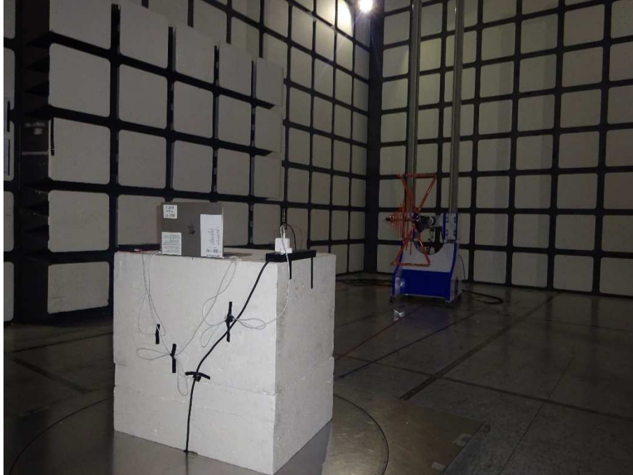
Figure 2 Radiated Disturbance - Above 1 GHz