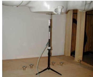
Figure 8-2 System Verification Setup Photo