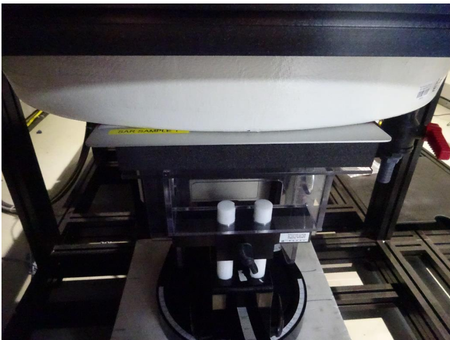
Rear Of Display – 0 mm separation distance.