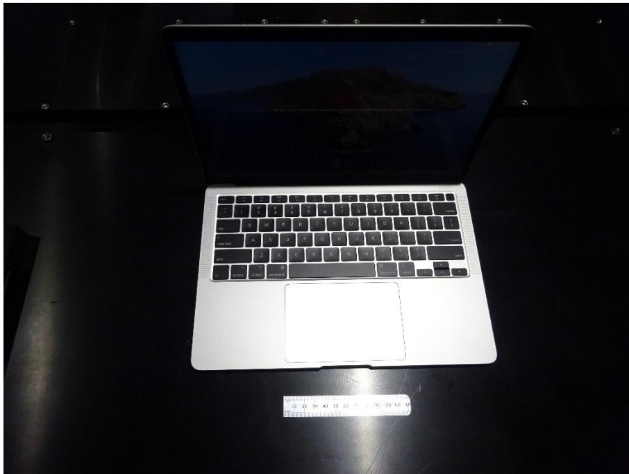
Top - Open