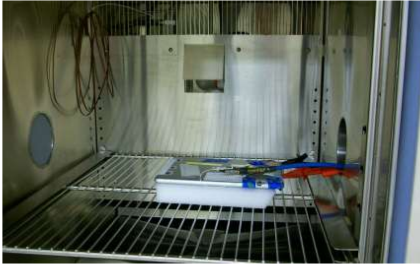
ENVIRONMENTAL CHAMBER PHOTO