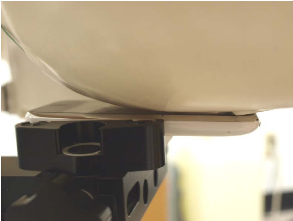
LEFT HAND SIDE TTILT (15°)