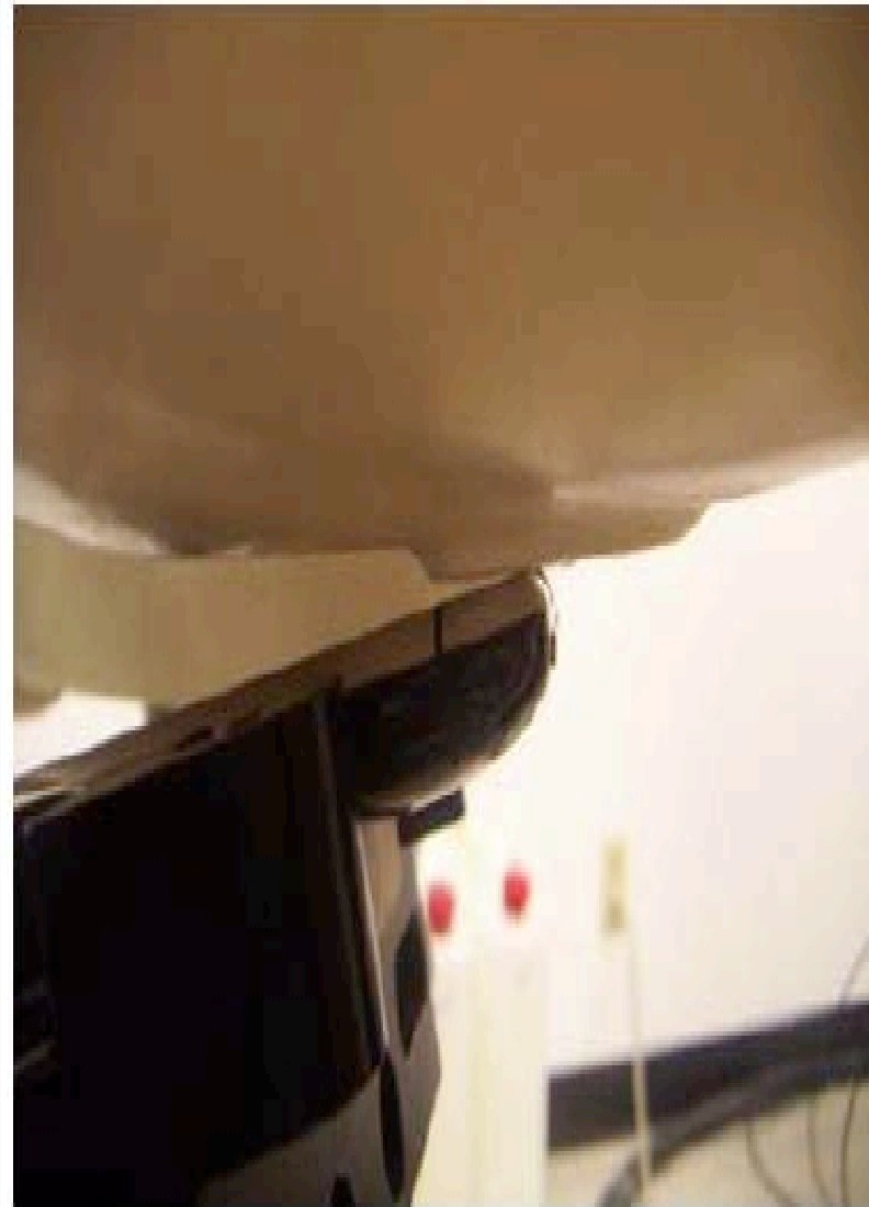
Tilt ( 15^\circ ) Position