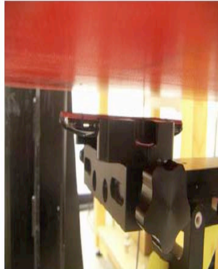
Front of EUT facing phantom