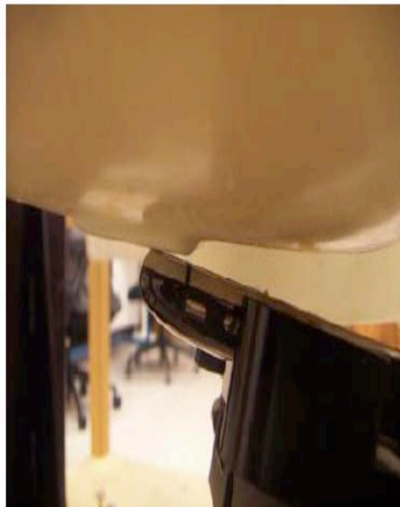
Tilt (15°) Position