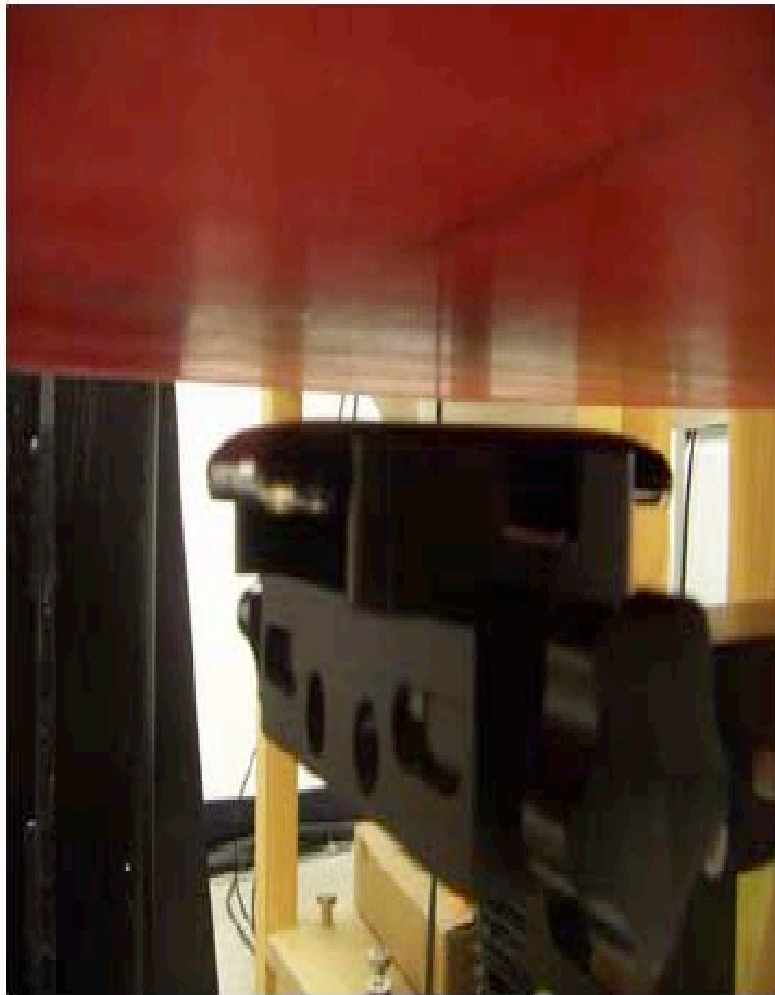
Back of EUT facing phantom