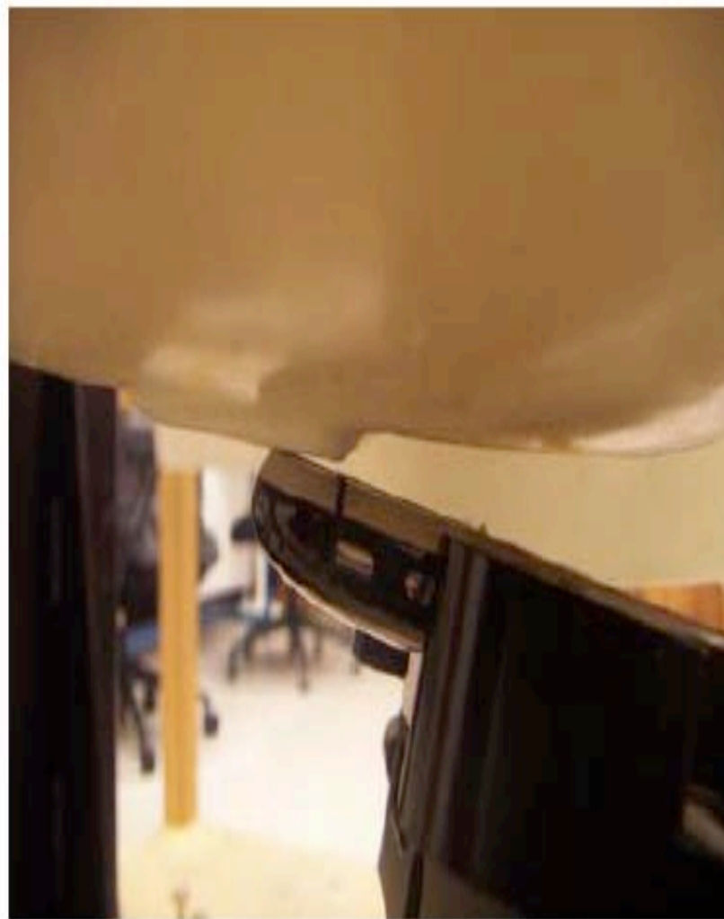
Tilt (15°) Position