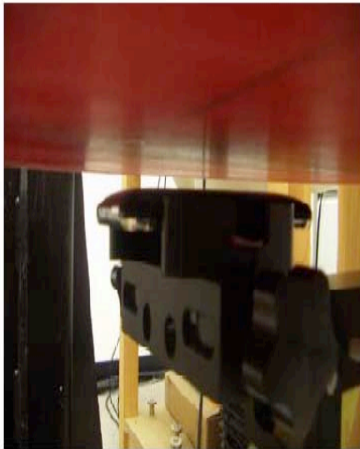
Back of EUT facing phantom