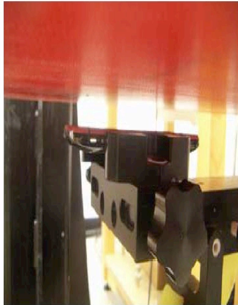
Front of EUT facing phantom