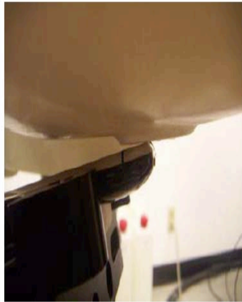
Tilt (15°) Position