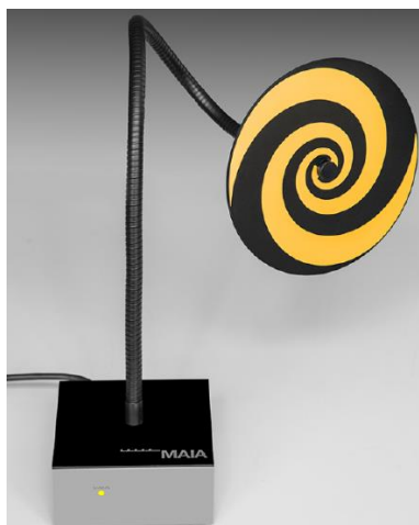
Figure 1: Modulation and Interference Analyzer (MAIA)

MAIA is a hardware interface for evaluating the modulation and audio interference characteristics of RF signals in the frequency range 698–6000 MHz. DASY6 evaluates the time-domain and frequency-domain properties of the uplink signal transmitted by the DUT during SAR measurement with MAIA. It uses USB-powered active electronics to identify the modulation of the DUT. It can be operated with the over-the-air interface using the built-in ultra-broadband planar log spiral antenna (698–6000 MHz) or in the conducted mode using the coaxial SMA 50W connector (300–6000 MHz).