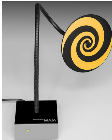
Figure 1: Modulation and Interference Analyzer (MAIA)

MAIA is a hardware interface for evaluating the modulation and audio interference characteristics of RF signals in the frequency range 698–6000 MHz. DASY6 evaluates the time-domain and frequency-domain properties of the uplink signal transmitted by the DUT during SAR measurement with MAIA. It uses USB-powered active electronics to identify the modulation of the DUT. It can be operated with the over-the-air interface using the built-in ultra-broadband planar log spiral antenna (698–6000 MHz) or in the conducted mode using the coaxial SMA 50W connector (300–6000 MHz).