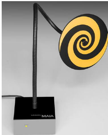
Figure 1: Modulation and Interference Analyzer (MAIA)

MAIA is a hardware interface for evaluating the modulation and audio interference characteristics of RF signals in the frequency range 698–6000 MHz. DASY6 evaluates the time-domain and frequency-domain properties of the uplink signal transmitted by the DUT during SAR measurement with MAIA. It uses USB-powered active electronics to identify the modulation of the DUT. It can be operated with the over-the-air interface using the built-in ultra-broadband planar log spiral antenna (698–6000 MHz) or in the conducted mode using the coaxial SMA 50W connector (300–6000 MHz).