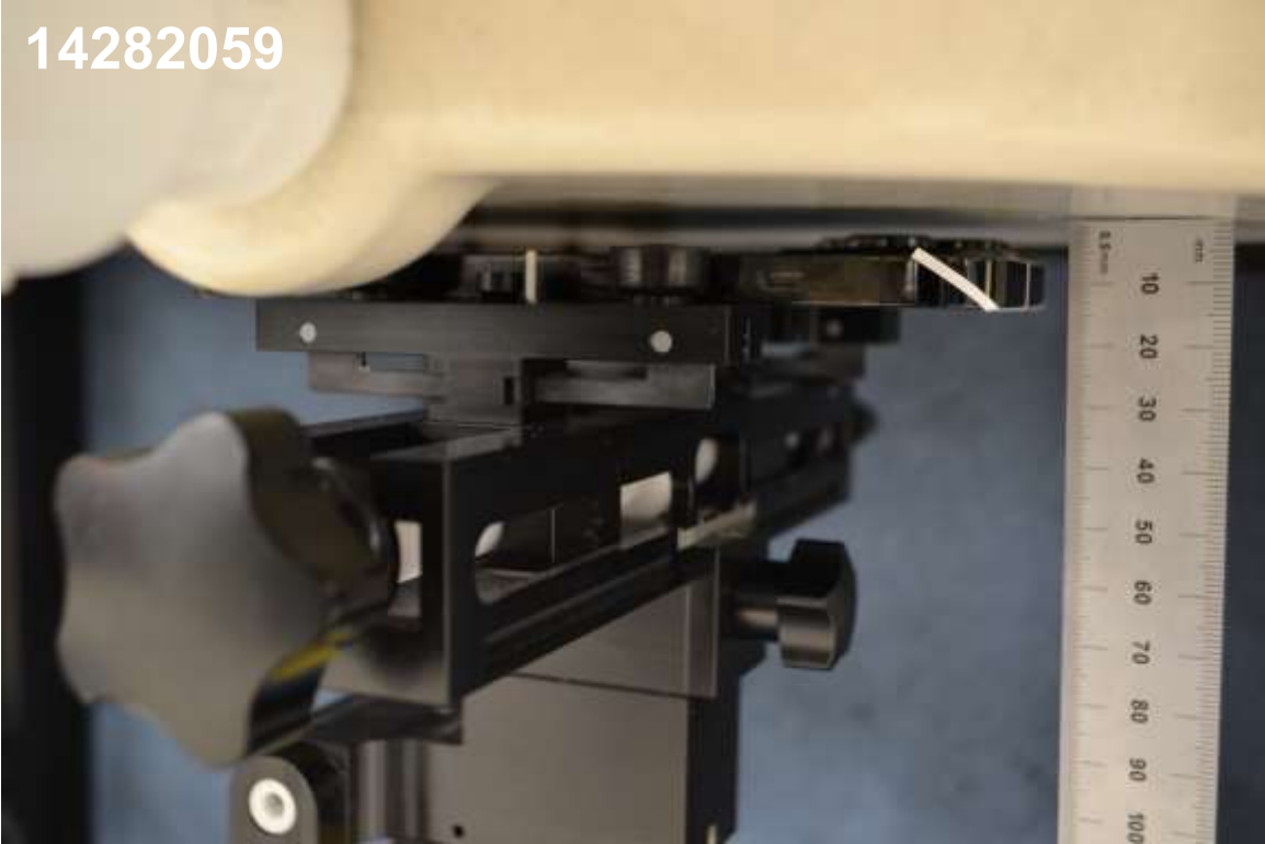
Photograph 6: Body & Hotspot, Rear, 5 mm