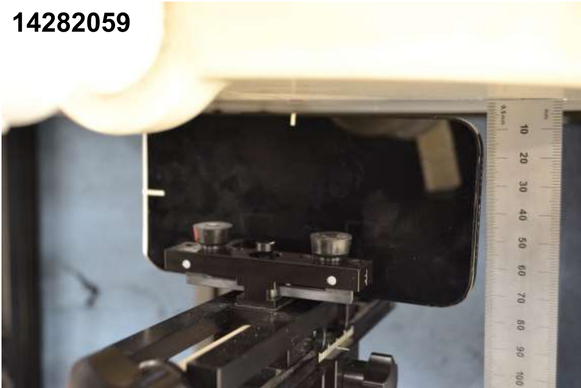
Photograph 8: Hotspot, Edge 4, 5 mm