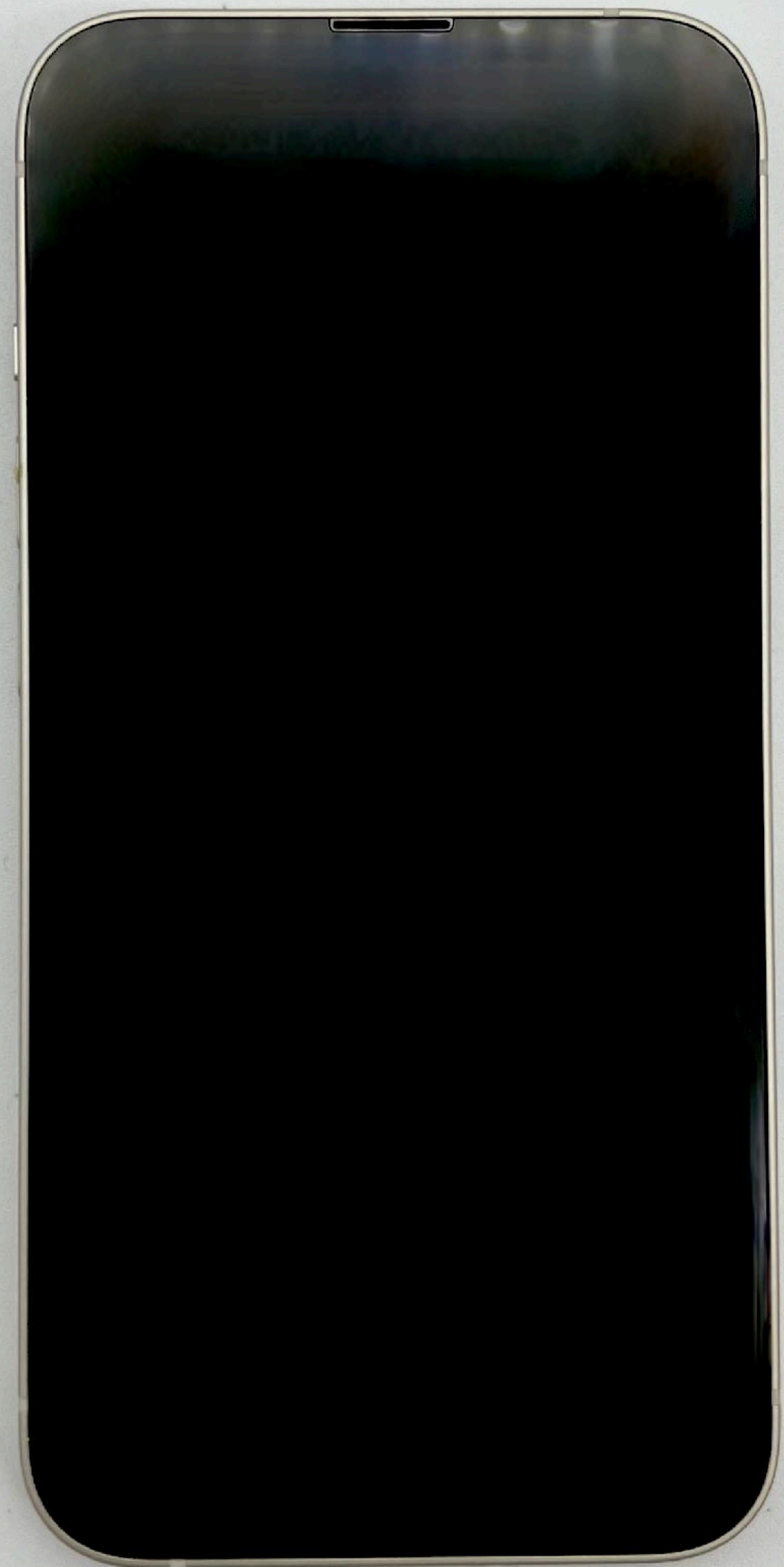
A2881, A2882, A2883, A2884 - Front Multi-Touch Panel, Display, Earpiece Receiver Face-time Camera