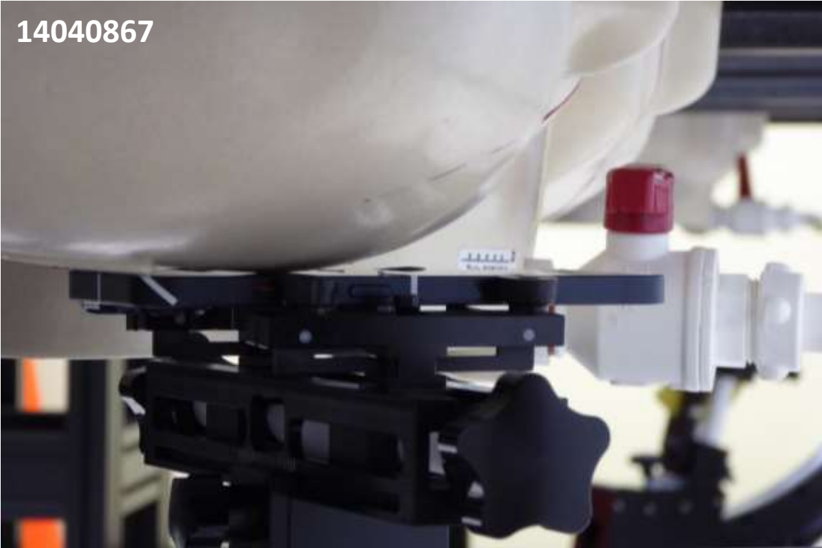
Right Tilt (15°)