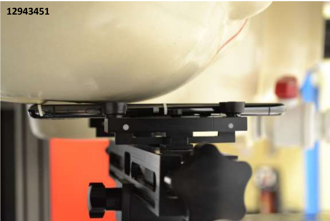
Right Tilt (15°)