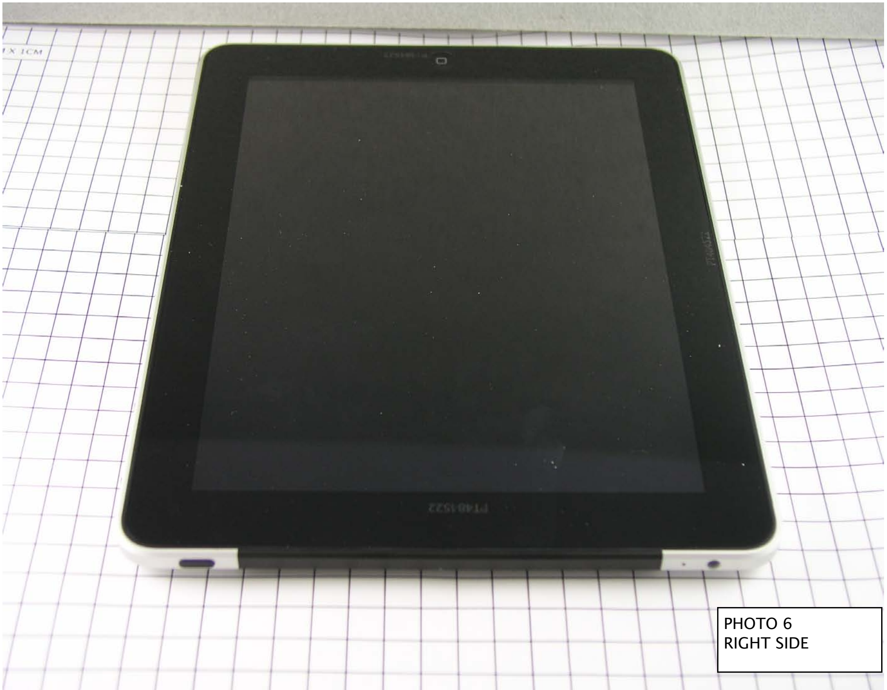
PHOTO 6 RIGHT SIDE