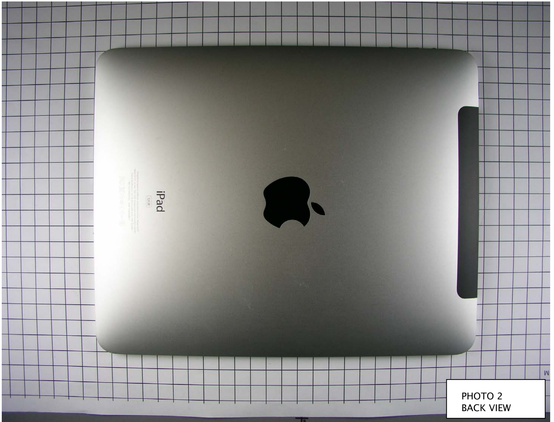
PHOTO 2 BACK VIEW