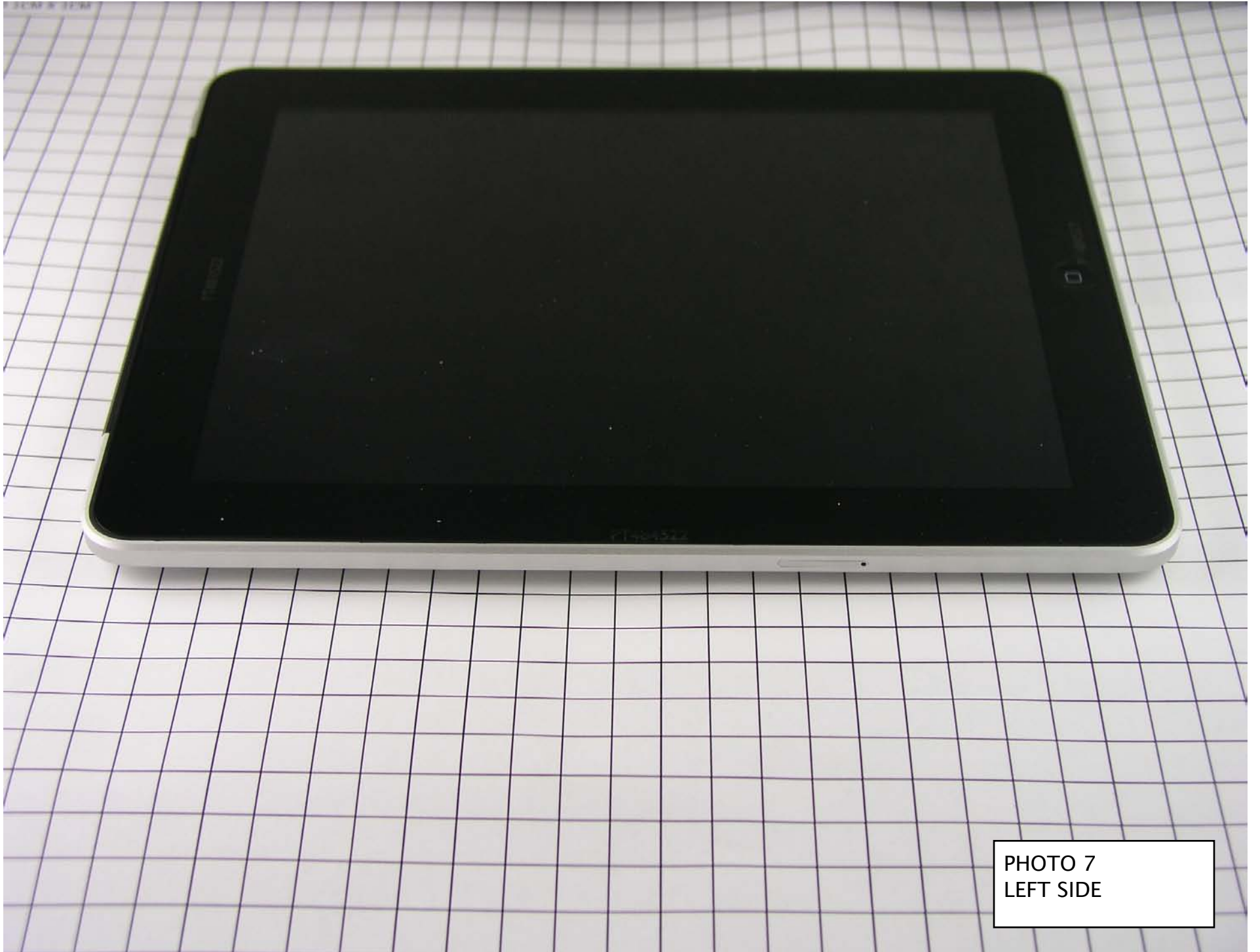
PHOTO 7 LEFT SIDE