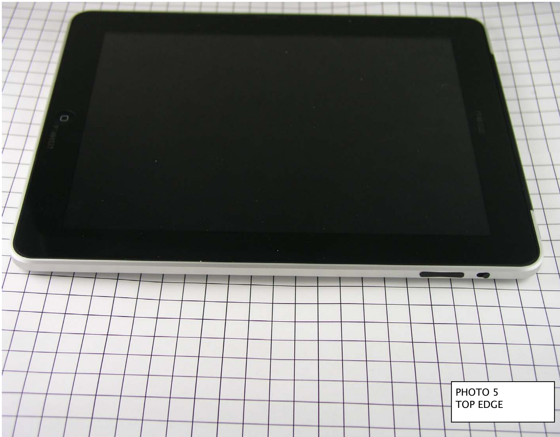
PHOTO 5 TOP EDGE