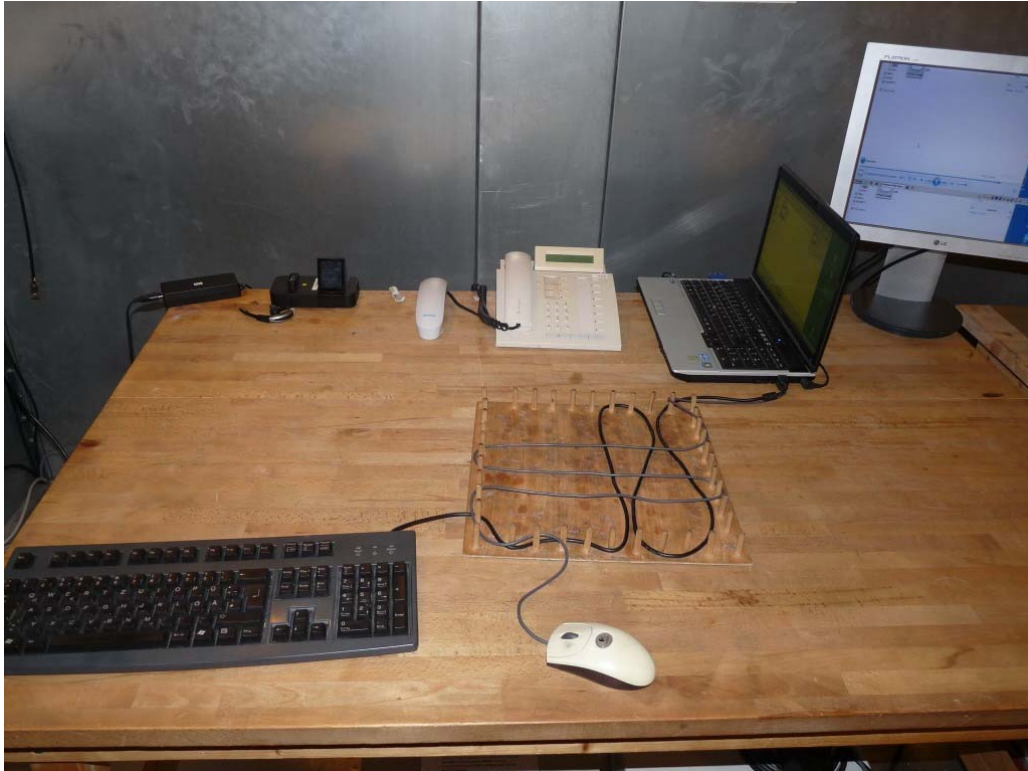
Photo 1: Test setup for conducted measurements (AC Port (power line), computer peripheral setup, EUT supplied by AC/DC Adaptor @ 120v/60Hz, intentional / unintentional radiator §15) Computer supplied by 110v 60Hz AC.