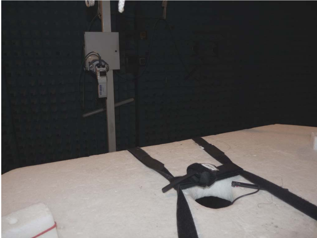
Photo 4: Test setup for radiated measurements (Enclosure, fully-anechoic chamber, 18-25 GHz, intentional radiator § 15)