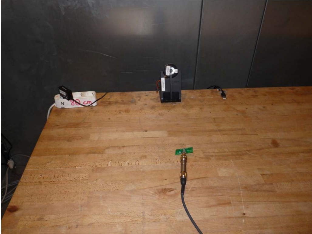
Photo 5: Test setup for conducted measurements (AC Port (power line), EUT supplied by AC/DC adapter, intentional / unintentional radiator §15)