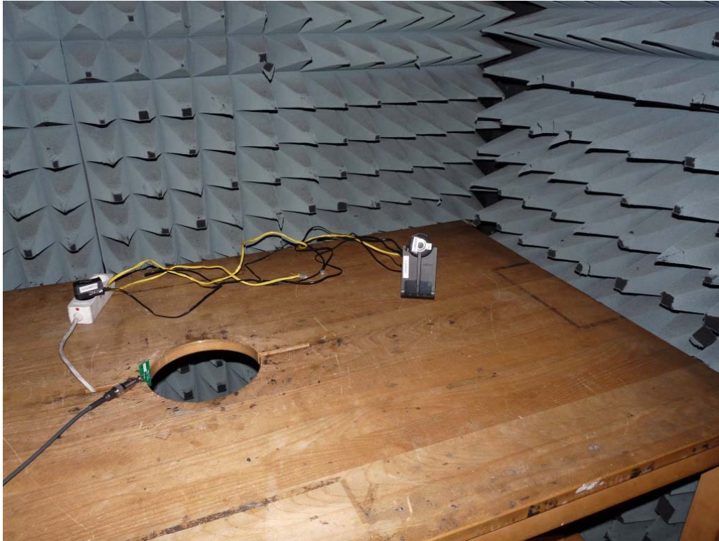
Photo 1: Test setup for radiated measurements (Enclosure, below 30 MHz, intentional radiator §15)