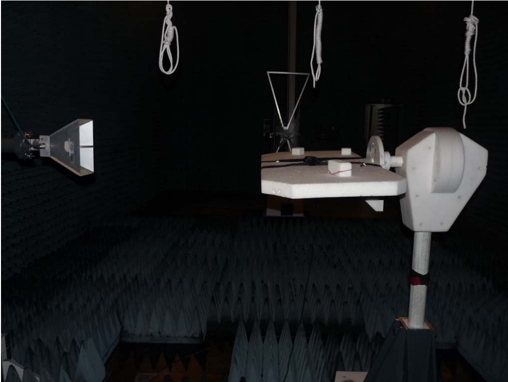
Photo 3: Test setup for radiated measurements (Enclosure, fully-anechoic chamber, 1-18 GHz intentional radiator §15 / 30 MHz – 10/20 GHz §22/24/27)