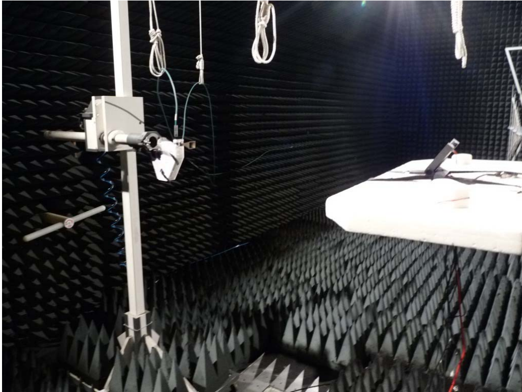
Photo 4: Test setup for radiated measurements (Enclosure, fully-anechoic chamber, 18-25 GHz, intentional radiator § 15)