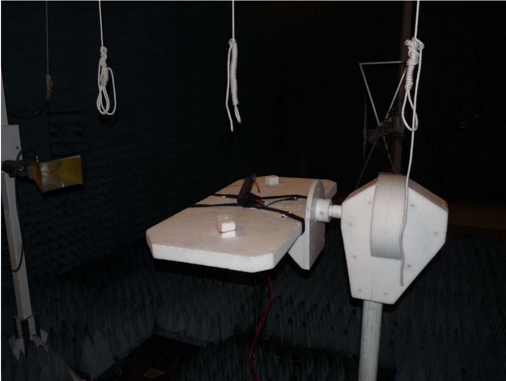
Photo 3: Test setup for radiated measurements (Enclosure, fully-anechoic chamber, 1-18 GHz intentional radiator §15 / 30 MHz – 10/20 GHz §22/24/27)