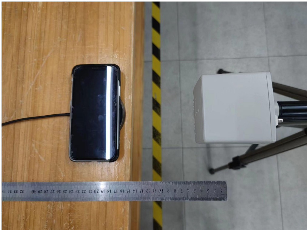
Test Position D-15cm from the edge of EUT to the geometric center of the probe