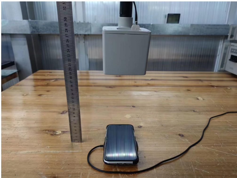
Test Position E-20cm from the edge of EUT to the geometric center of the probe