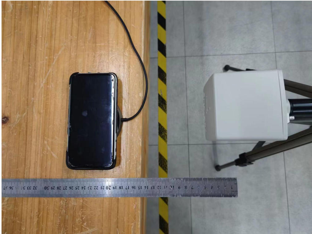
Test Position C-15cm from the edge of EUT to the geometric center of the probe