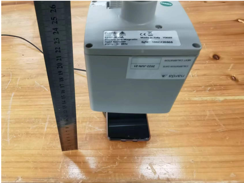
Test Position E-15cm from the edge of EUT to the geometric center of the probe