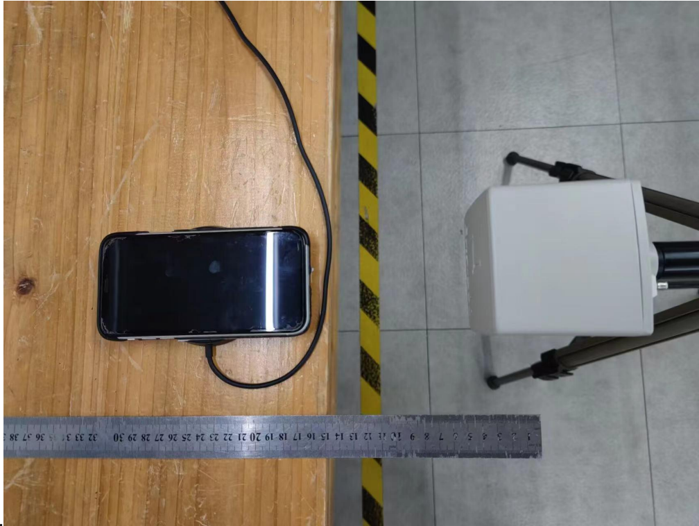
Test Position A-15cm from the edge of EUT to the geometric center of the probe