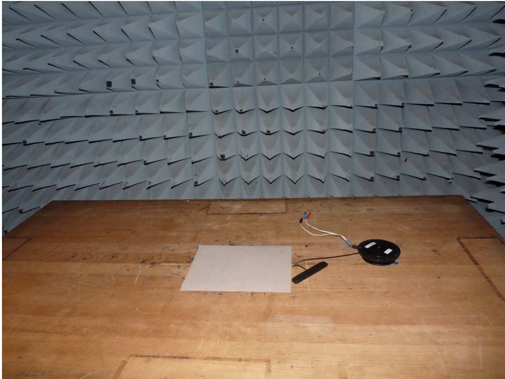
Photo 1: Test setup for radiated measurements (Enclosure, below 30 MHz)