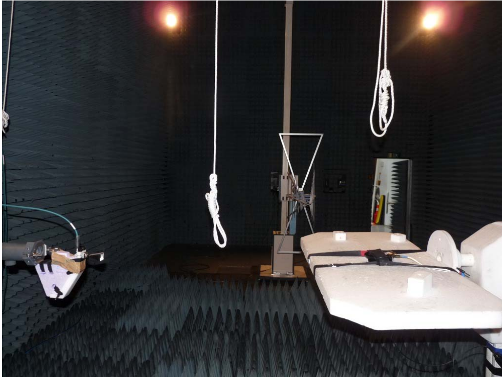
Photo 3: Test setup for radiated measurements (Enclosure, above 1 GHz)