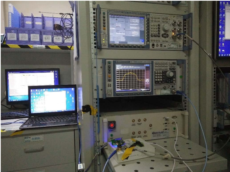
Conducted Test 1