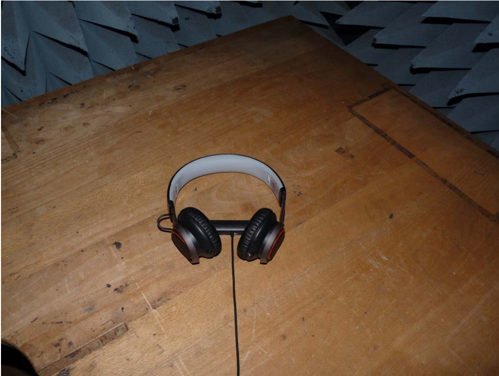
Photo 1: Test setup for radiated measurements (Enclosure, below 30 MHz, intentional radiator §15)