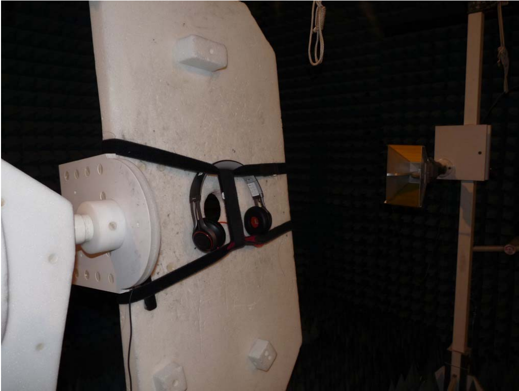
Photo 3: Test setup for radiated measurements (Enclosure, fully-anechoic chamber, 1-18 GHz intentional radiator §15 / 30 MHz – 10/20 GHz §22/24/27)