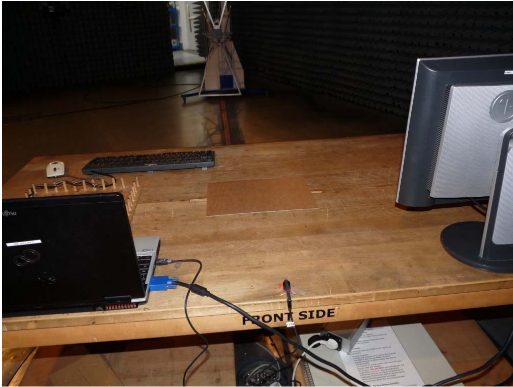
Photo 2: Test setup for radiated measurements (computer peripheral setup, unintentional radiator §15)