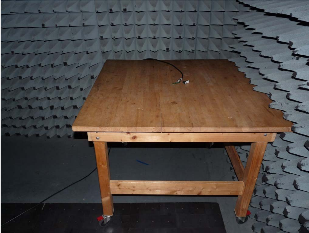
Photo 1: Test setup for radiated measurements (Enclosure, below 30 MHz, intentional radiator §15)