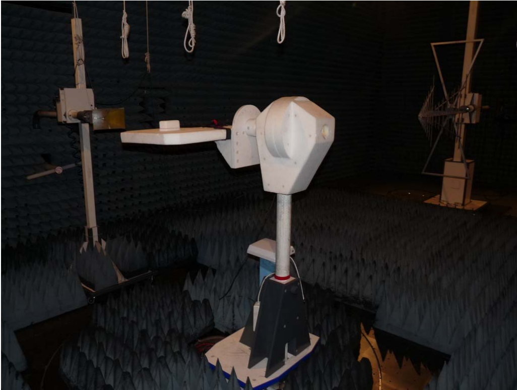
Photo 3: Test setup for radiated measurements (Enclosure, fully-anechoic chamber, 1-18 GHz intentional radiator §15 / 30 MHz – 10/20 GHz §22/24/27)