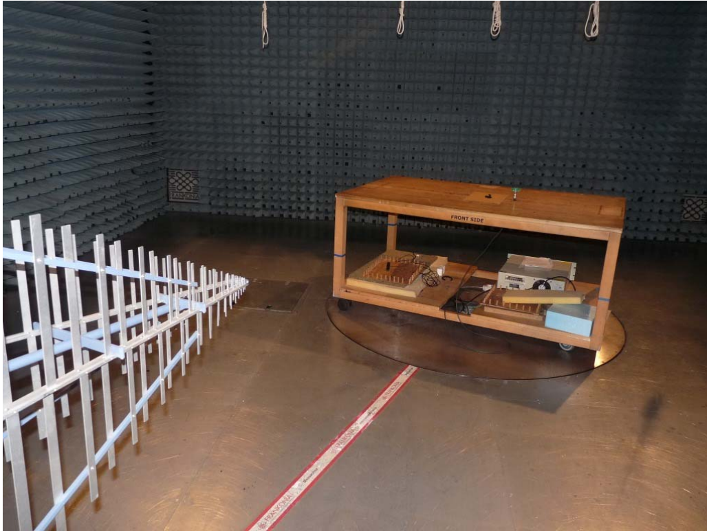
Photo 2: Test setup for radiated measurements (Enclosure, semi-anechoic chamber, 30 MHz to 1 GHz, intentional radiator §15)