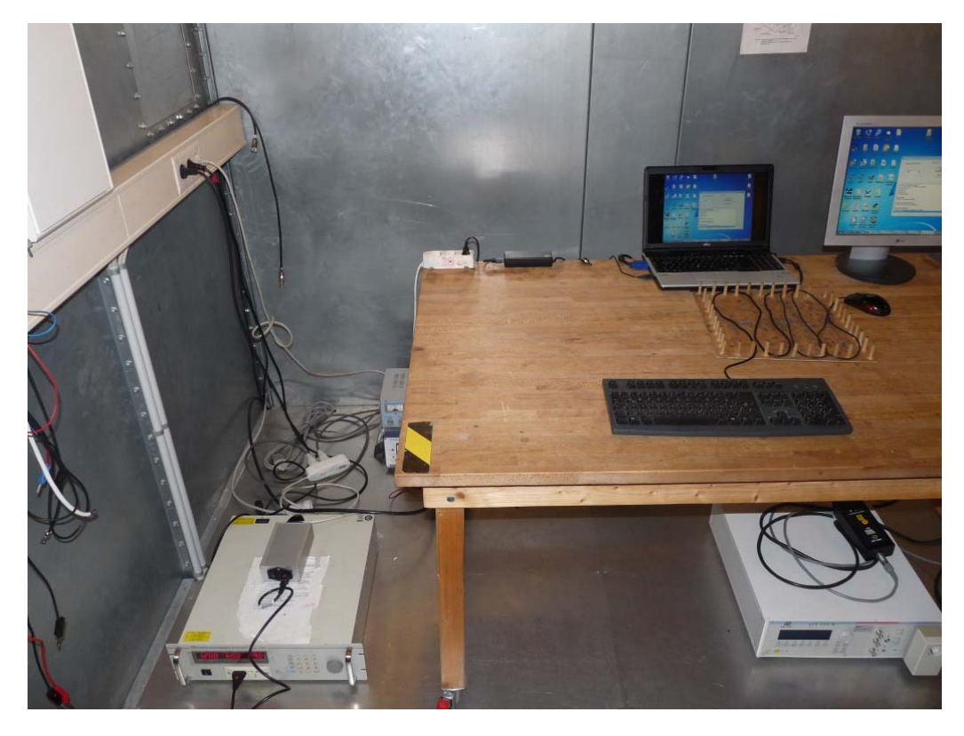
Photo 1: Test setup for conducted measurements (computer peripheral setup, EUT supplied by USB-cable from computer, unintentional radiator §15)