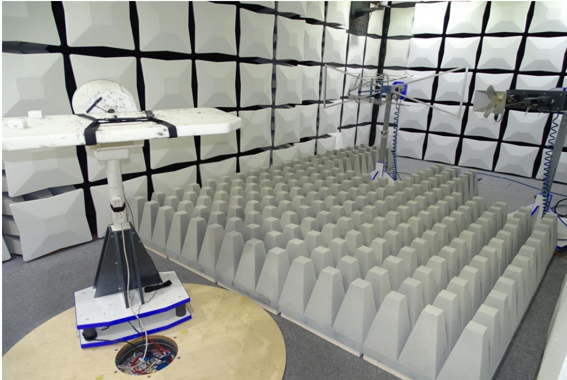
Photo 3: Test setup for radiated measurements (Enclosure, fully-anechoic chamber, 1-26 GHz intentional radiator §15, ANSI C63.10)