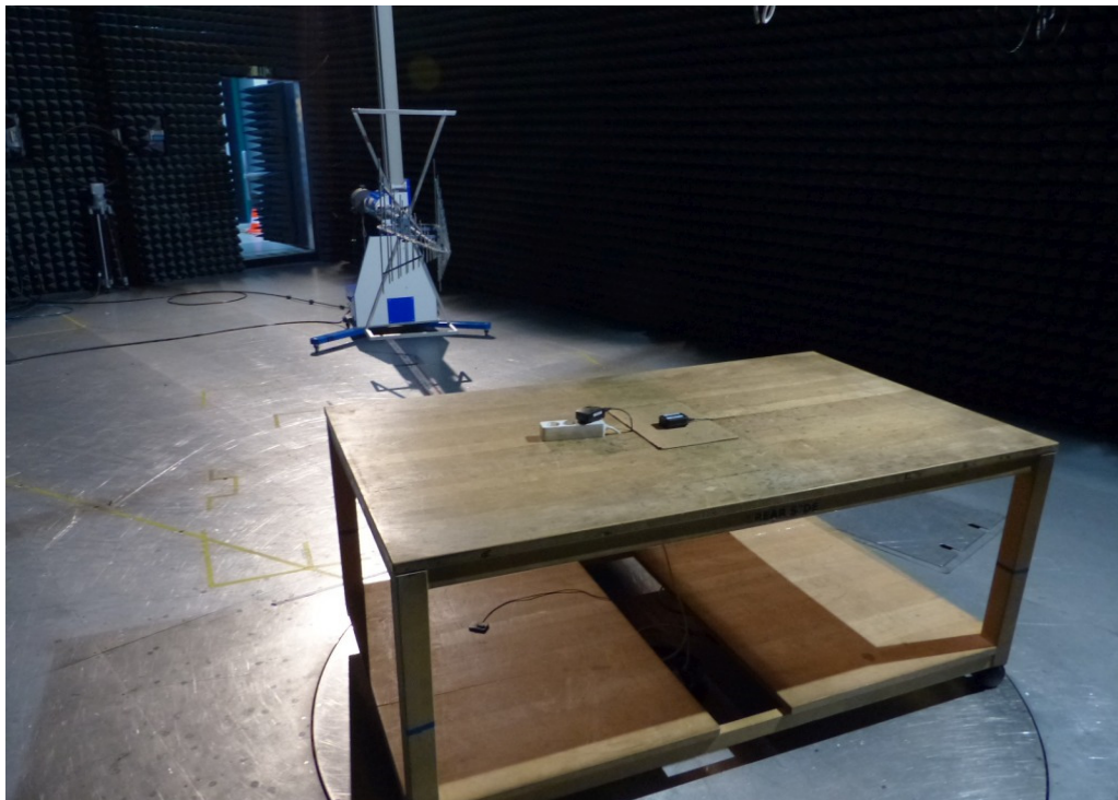
Photo 2: Test setup for radiated measurements (Enclosure, semi-anechoic chamber, 30 MHz to 1 GHz, intentional radiator §15, ANSI C63.10)