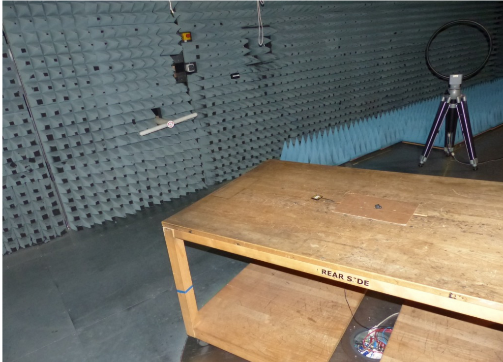
Photo 1: Test setup for radiated measurements (Enclosure, below 30 MHz, intentional radiator §15, ANSI C63.10)