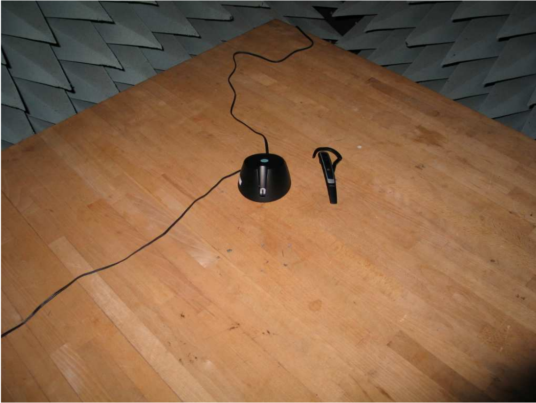
Photo 1: Test setup for radiated measurements (Enclosure, Setup_c01, below 30 MHz)