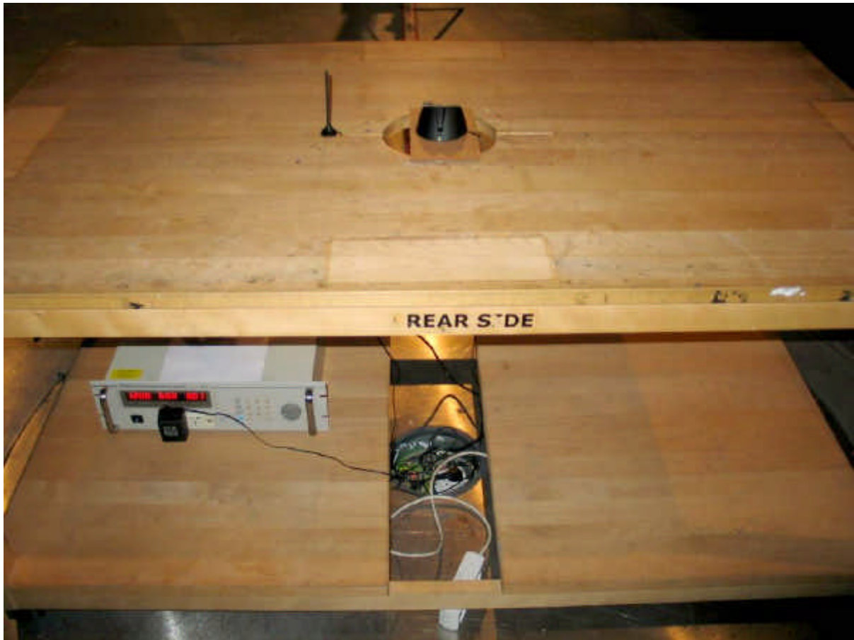
Photo 2: Test setup for radiated measurements (between 30 MHz and 1 GHz)