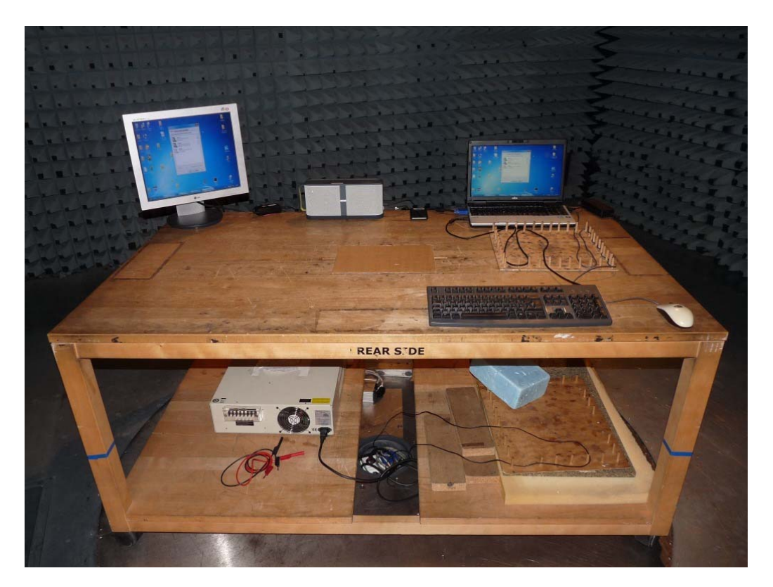
Photo 2: Test setup for radiated measurements (computer peripheral setup, EUT supplied by AC/DC Adapter. USB-cable from computer used for streaming music, USB cable to mobile phone for charging), unintentional radiator §15)