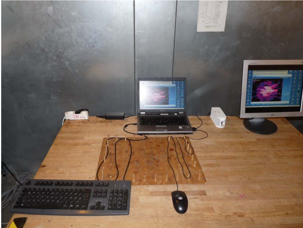
Photo 2: Test setup for conducted measurements (computer peripheral setup, EUT supplied by USB-cable from computer, unintentional radiator §15)