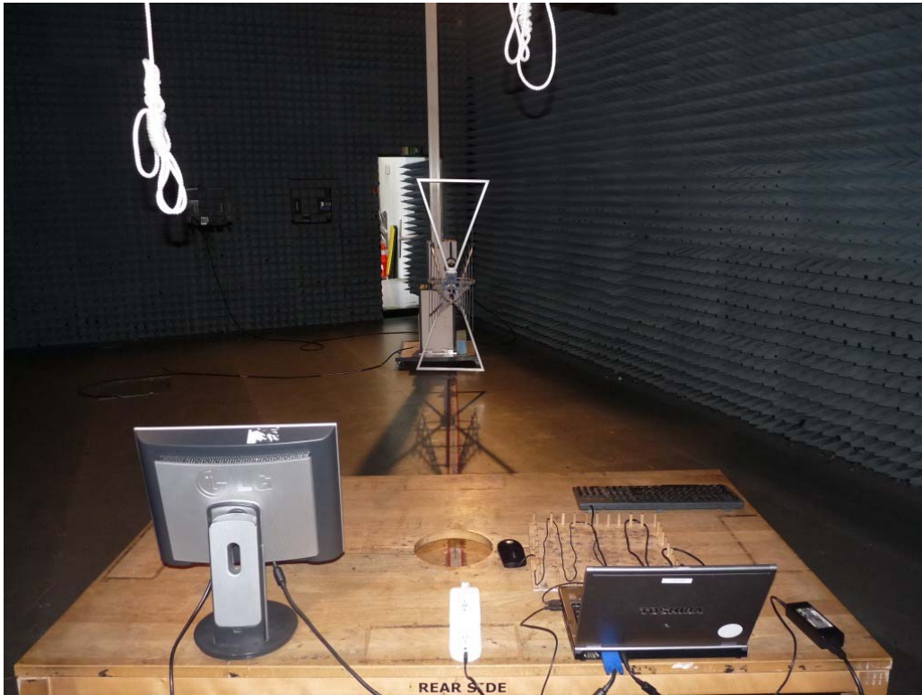
Photo 3: Test setup for radiated measurements (computer peripheral setup, EUT supplied by USB-cable from computer, unintentional radiator $15)