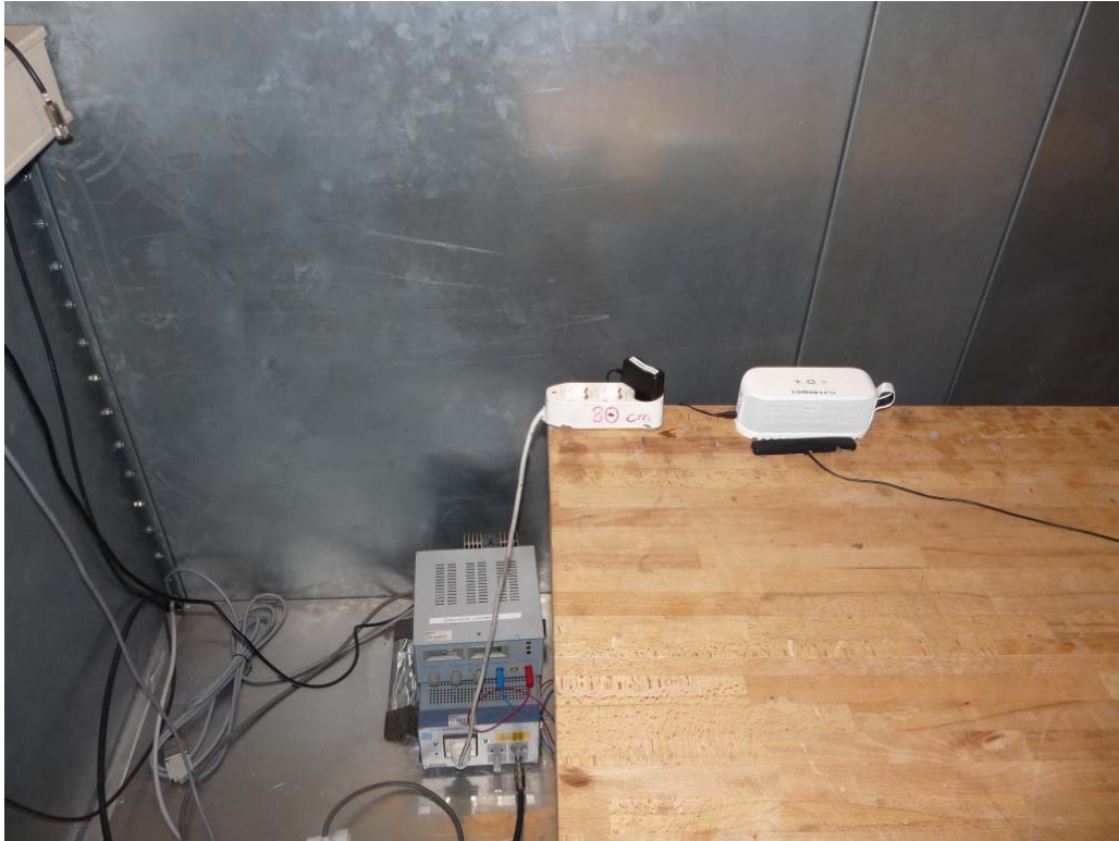
Photo 1: Test setup for conducted measurements (AC Port (power line), EUT supplied by AC/DC adapter, intentional / unintentional radiator §15)