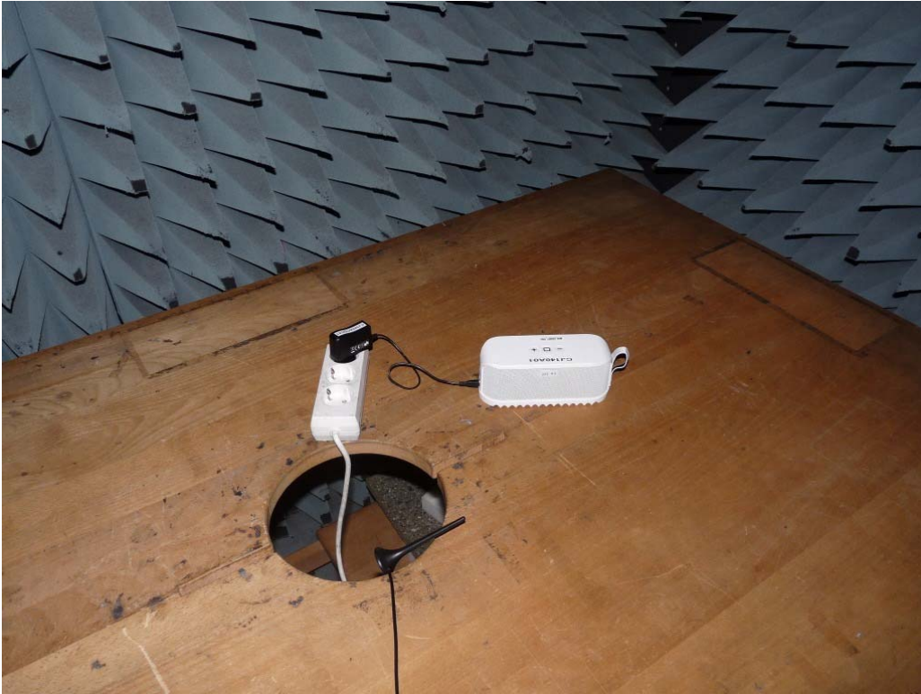
Photo 1: Test setup for radiated measurements (Enclosure, below 30 MHz, intentional radiator §15)