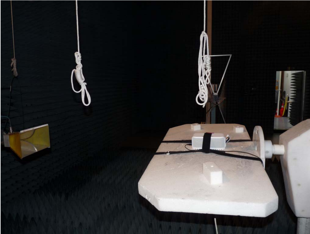
Photo 4: Test setup for radiated measurements (Enclosure, fully-anechoic chamber, 18-25 GHz, intentional radiator § 15)